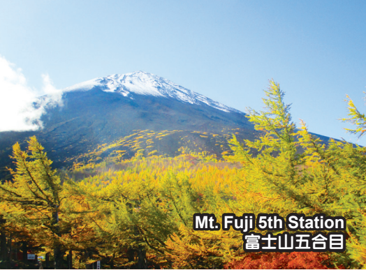
Mt. Fuji 5th Station 富士山五合目