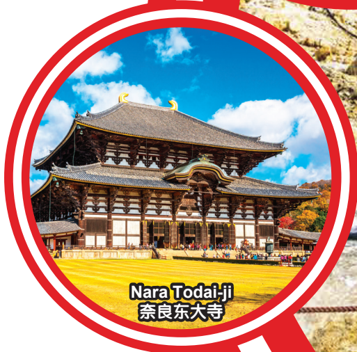
Nara Todai-ji 奈良东大寺

行程次序，以当地旅社安排为准。 Sequences of Itinerary are subject to local arrangement.