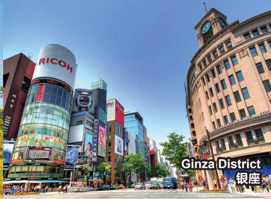
Ginza District 銀座