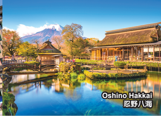
Oshino Hakkaï 忍野八海