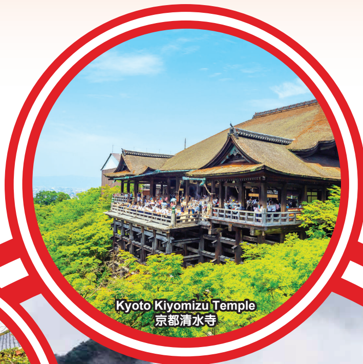
Kyoto Kiyomizu Temple 京都清水寺