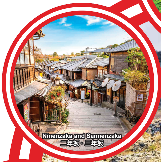
Ninenzaka and Sannenzaka 三年坂・三年坂