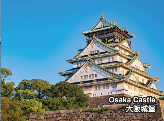
Osaka Castle 大阪城堡