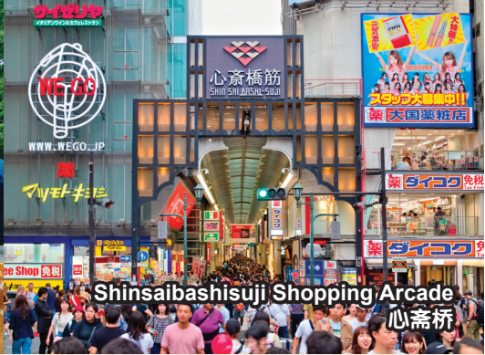
Shinsaibashisuji Shopping Arcade 心斋桥