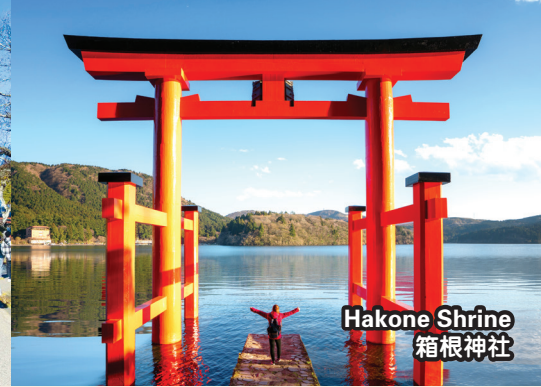
Hakone Shrine 箱根神社