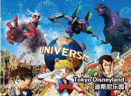
Tokyo Disneyland 迪士尼乐园