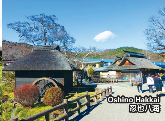
Oshino Hakkai 忍也八海