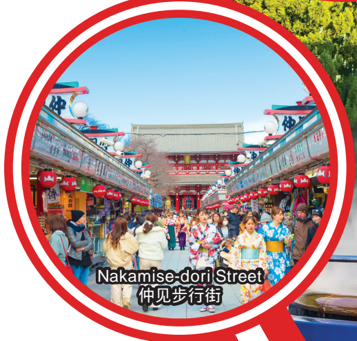
Nakamise-dori Street 仲见步行街