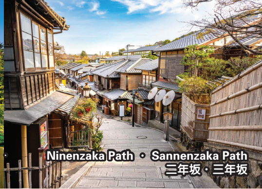
Ninenzaka Path • Sannenzaka Path 三年坂 • 三年坂