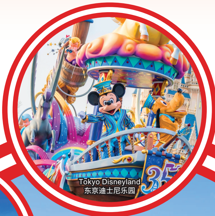
Tokyo Disneyland 东京迪士尼乐园