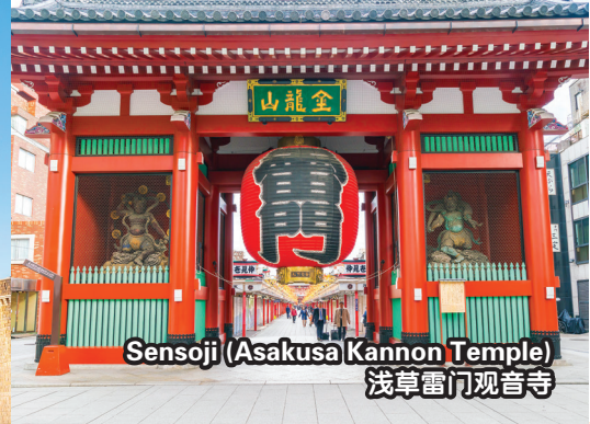
Sensoji (Asakusa Kannon Temple) 浅草雷门观音寺