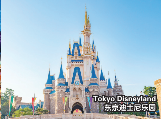
Tokyo Disneyland 东京迪士尼乐园