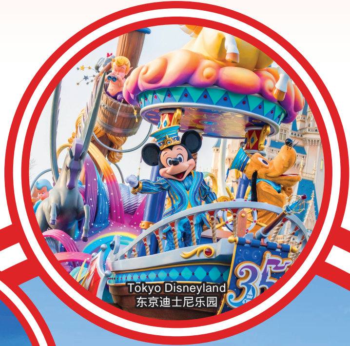
Tokyo Disneyland 东京迪士尼乐园