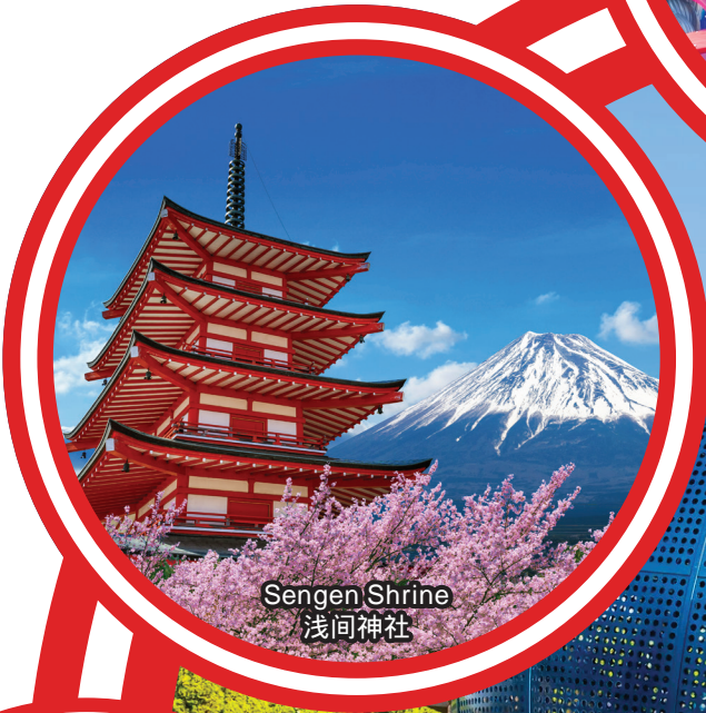
Sengen Shrine 浅间神社