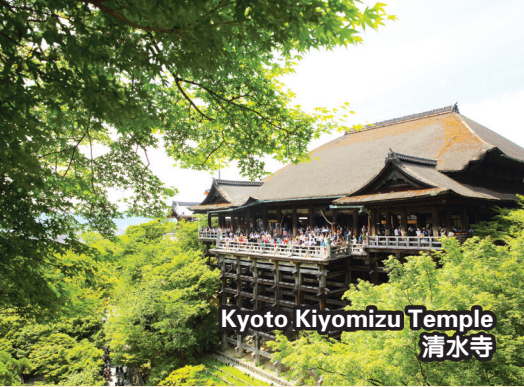
Kyoto Kiyomizu Temple 清水寺