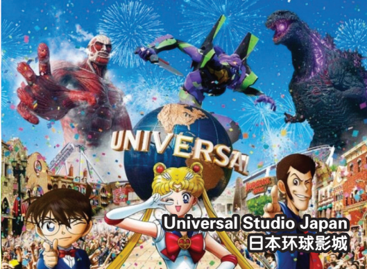
Universal Studio Japan 日本环球影城