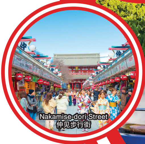
Nakamise-dori Street 仲见步行街