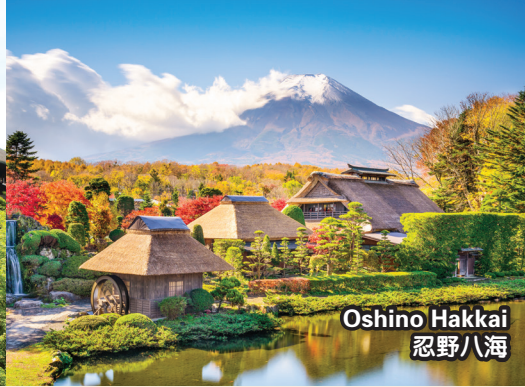
Oshino Hakkai 忍野八海