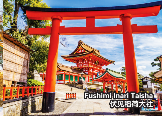
Fushimi Inari Taisha 伏见稻荷大社