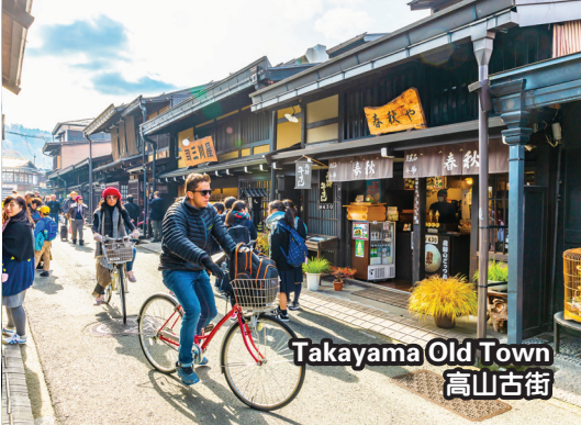
Takayama Old Town 高山古街