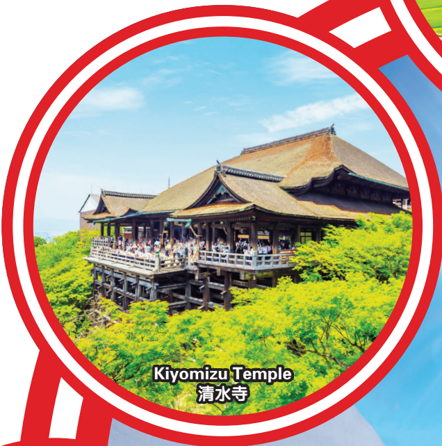
Kiyomizu Temple 清水寺