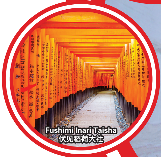
Fushimi Inari Taisha 伏見稲荷大社