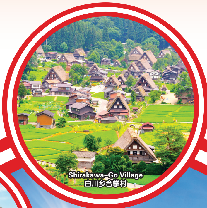
Shirakawa-Go Village 白川郷合掌村