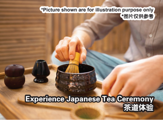
Experience Japanese Tea Ceremony 茶道体验

*Picture shown are for illustration purpose only *图片仅供参考