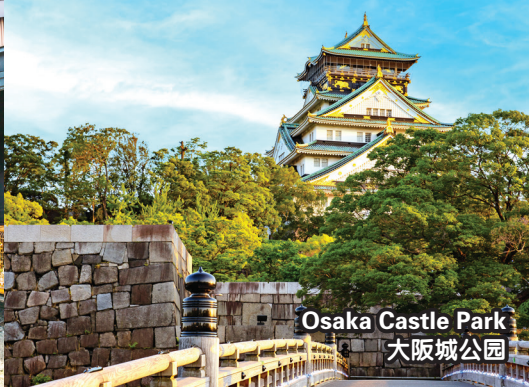
Osaka Castle Park 大阪城公园