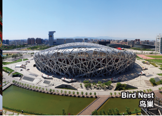
Bird Nest 鸟巢