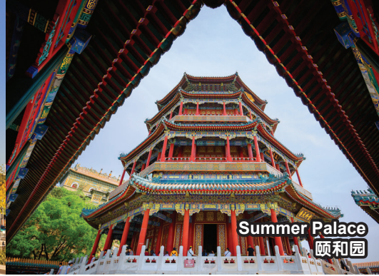
Summer Palace 颐和园