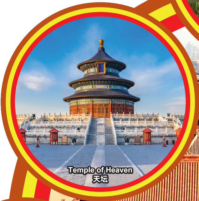
Temple of Heaven 天坛