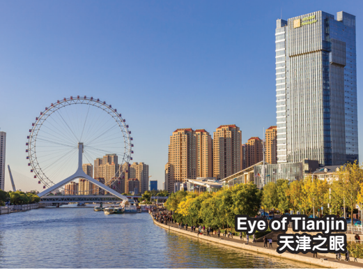
Eye of Tianjin 天津之眼