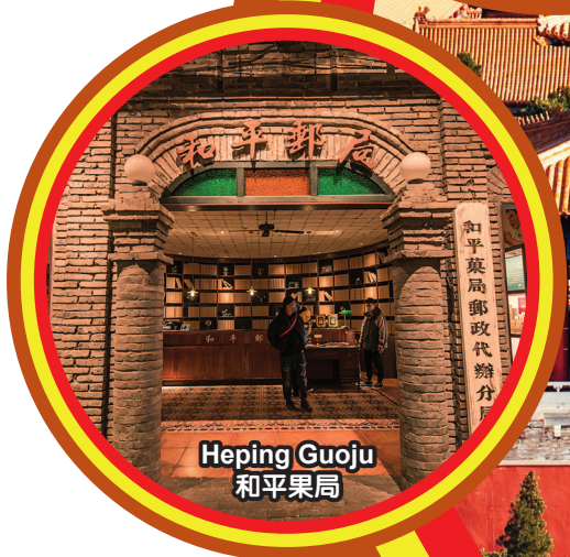
Heping Guoju 和平果局