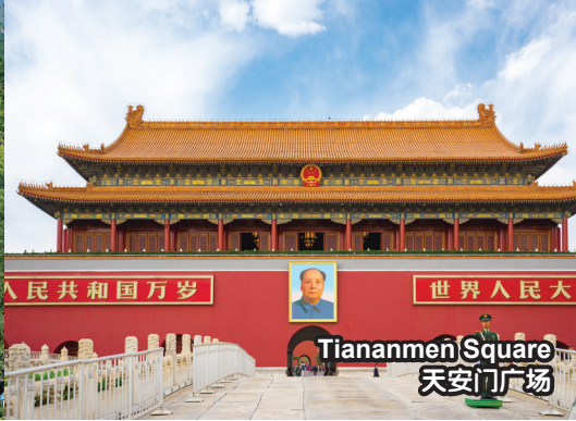
天安门广场 Tiananmen Square 天安门广场