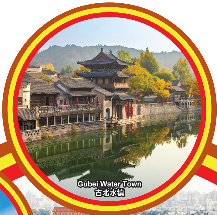
Gubei Water Town 古北水镇