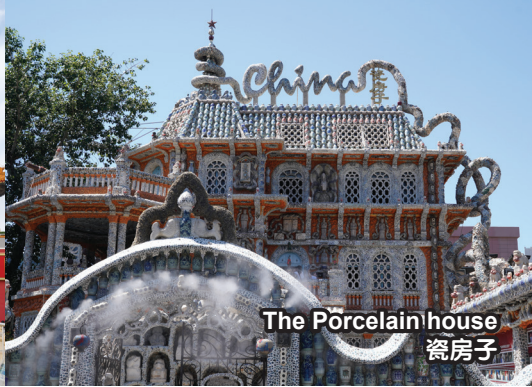
The Porcelain house 瓷房子