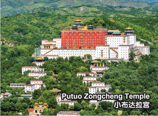
Putuo Zongcheng Temple 小布达拉宫