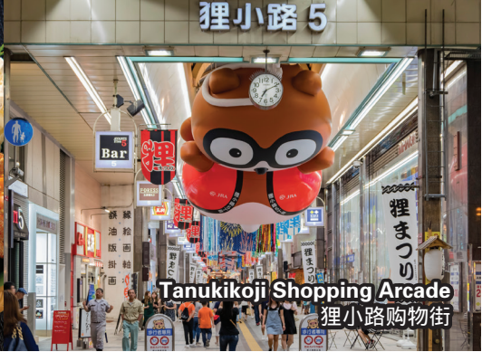
Tanukikoji Shopping Arcade 狸小路购物街