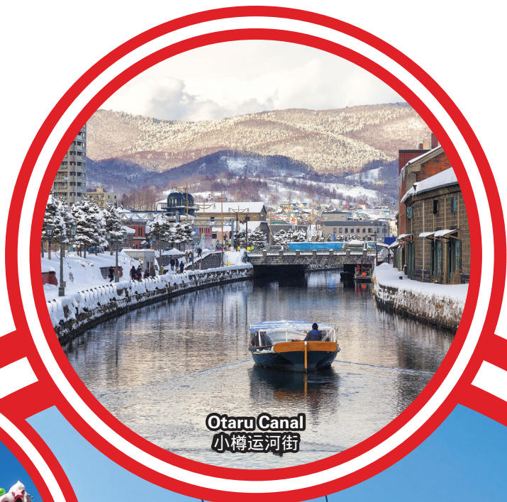
Otaru Canal 小樽运河街