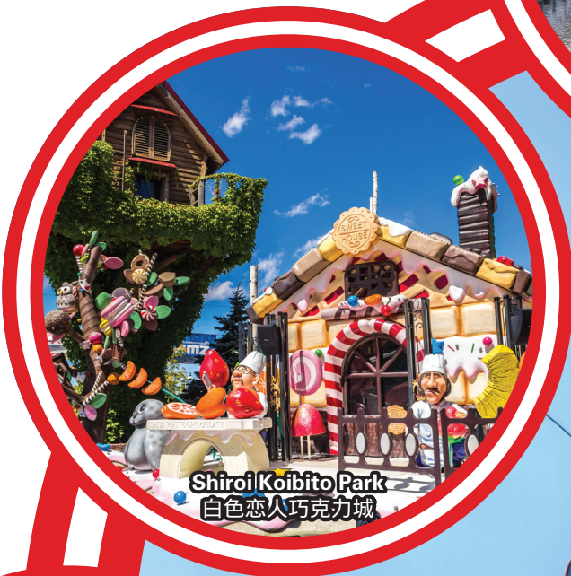
Shiroi Koibito Park 白色恋人巧克力城