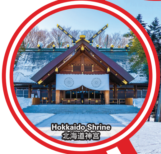
Hokkaido Shrine 北海道神宮

行程次序，以當地旅社安排為準。 Sequences of Itinerary are subject to local arrangement.