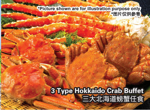
3 Type Hokkaido Crab Buffet 三大北海道螃蟹任食