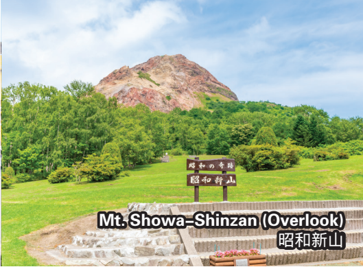
Mt. Showa-Shinzan (Overlook) 昭和新山