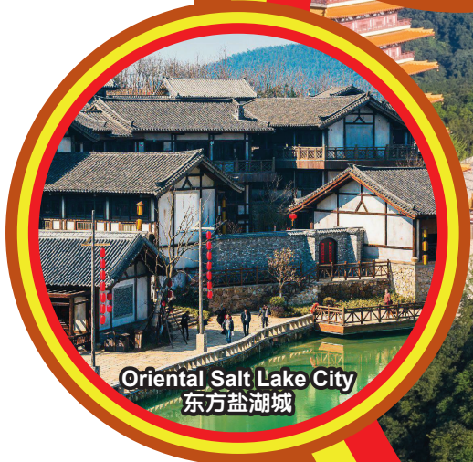
Oriental Salt Lake City 东方盐湖城