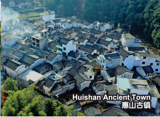
Huishan Ancient Town 惠山古镇