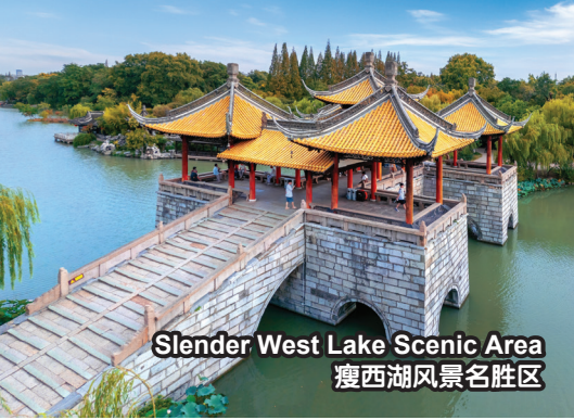
Slender West Lake Scenic Area 瘦西湖风景名胜