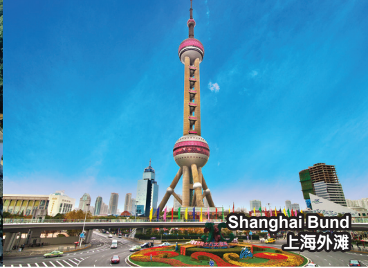
Shanghai Bund 上海外滩