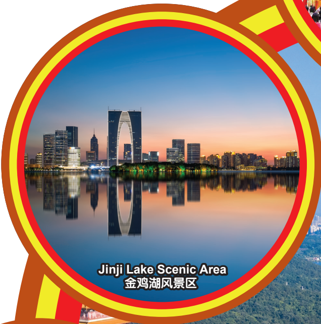
Jinji Lake Scenic Area 金鸡湖风景区