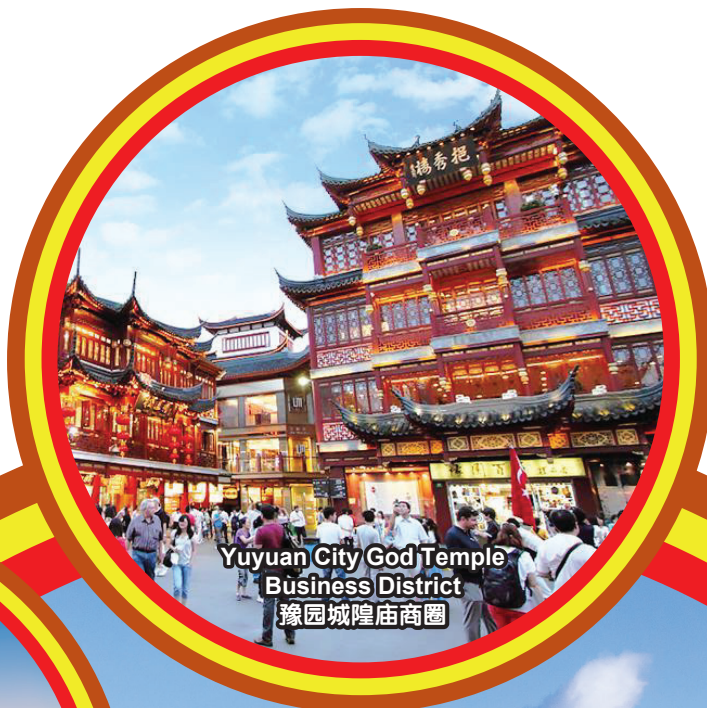
Yuyuan City God Temple Business District 豫园城隍庙商圈