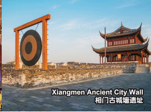
Xiangmen Ancient City Wall 相门古城墙遗址