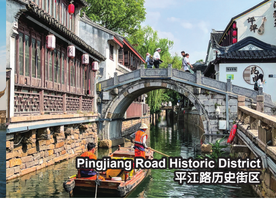
Pingjiang Road Historic District 平江路历史街区