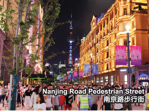
Nanjing Road Pedestrian Street 南京路步行街