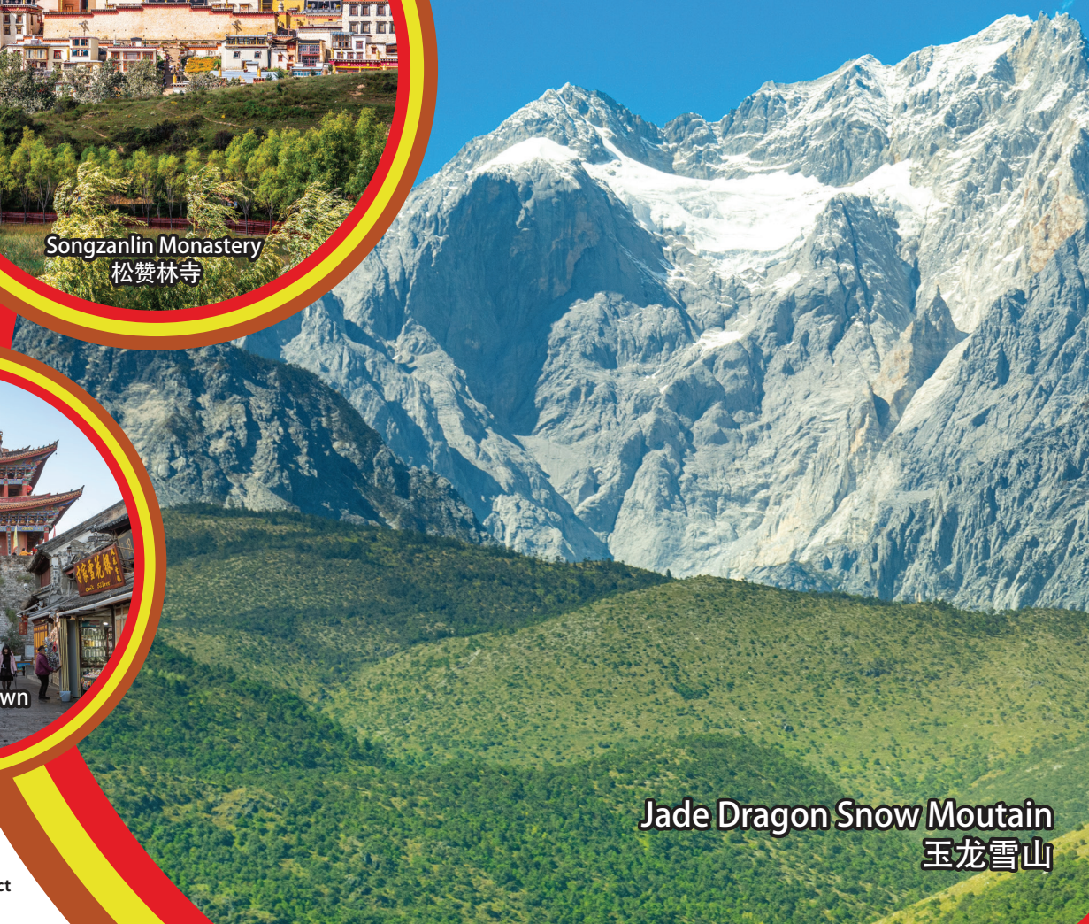
Jade Dragon Snow Mountain 玉龙雪山

行程次序, 以当地旅社安排为准。 Sequences of Itinerary are subject to local arrangement.