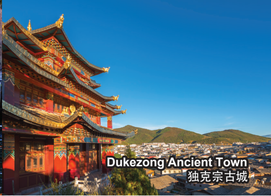
Dukezong Ancient Town 独克宗古城