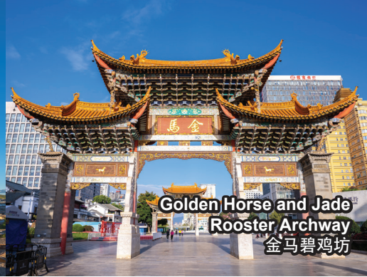
Golden Horse and Jade Rooster Archway 金马碧鸡坊