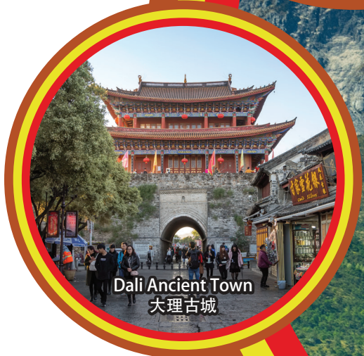
Dali Ancient Town 大理古城