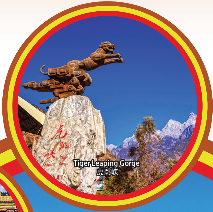
Tiger Leaping Gorge 虎跳峡