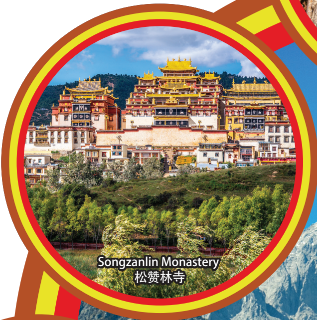
Songzanlin Monastery 松赞林寺