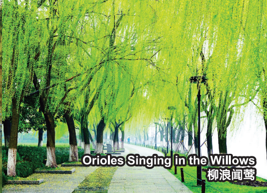
Orioles Singing in the Willows 柳浪闻莺