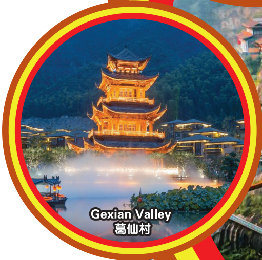
Gexian Valley 葛仙村