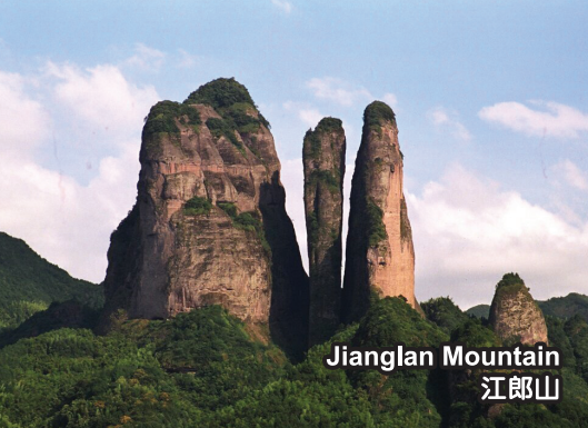
Jiangnan Mountain 江郎山