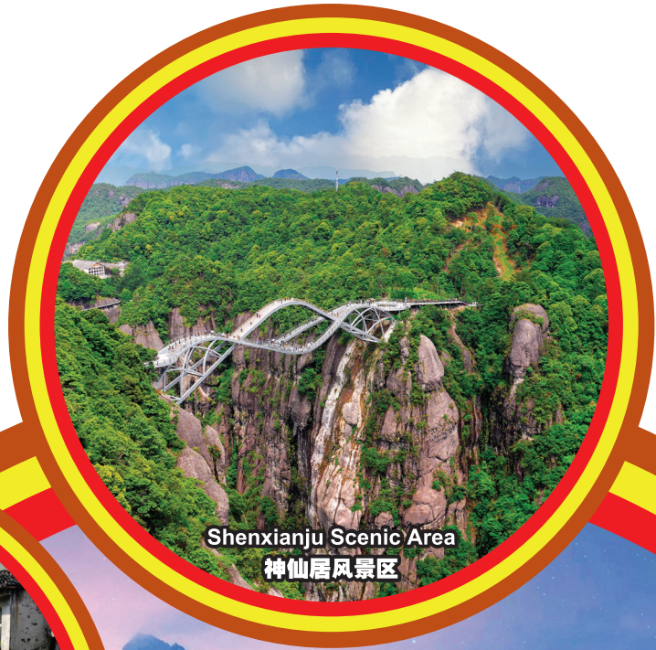
Shenxianju Scenic Area 神仙居风景区