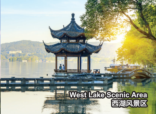
West Lake Scenic Area 西湖风景区