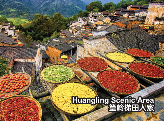
Huangling Scenic Area 皇岭梯田人家