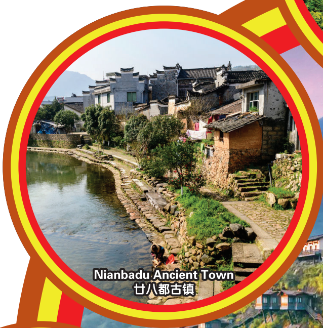
Nianbadu Ancient Town 廿八都古镇