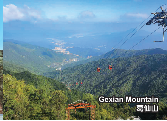
Gexian Mountain 葛仙山