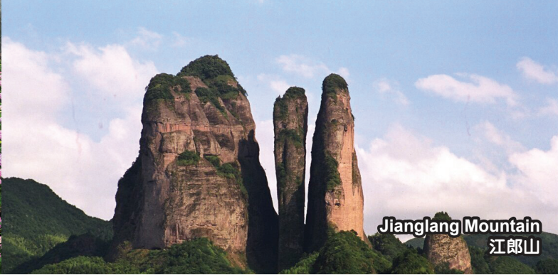
Jianglang Mountain 江郎山