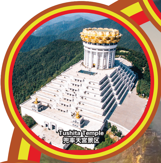
Tushita Temple 兜率天宫景区