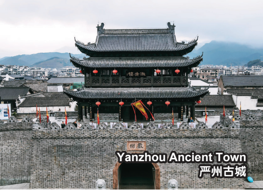
Yanzhou Ancient Town 严州古城