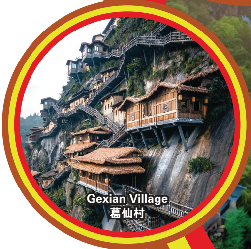
Gexian Village 葛仙村