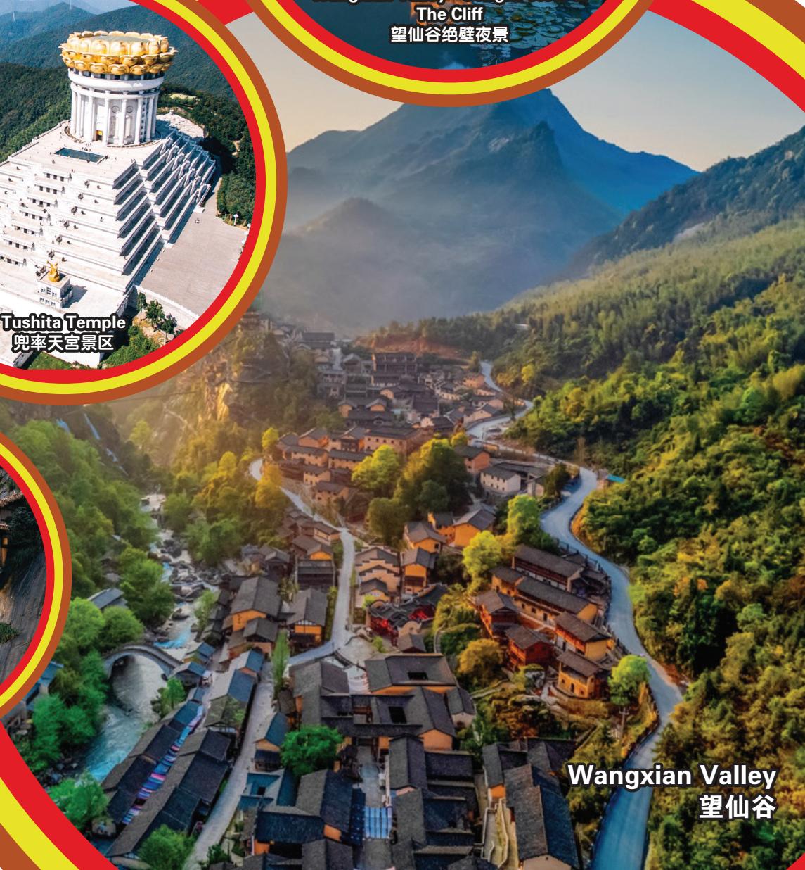
Wangxian Valley 望仙谷

行程次序, 以当地旅社安排为准。 Sequences of Itinerary are subject to local arrangement.