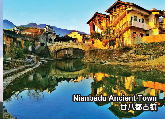
Nianbadu Ancient Town 廿八都古镇