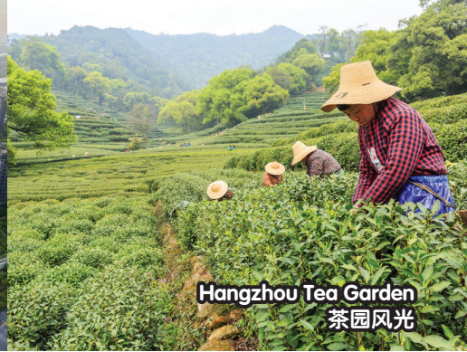
Hangzhou Tea Garden 茶园风光