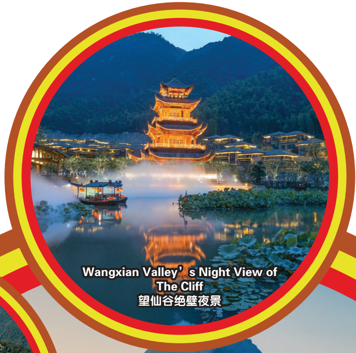
Wangxian Valley's Night View of The Cliff 望仙谷绝壁夜景