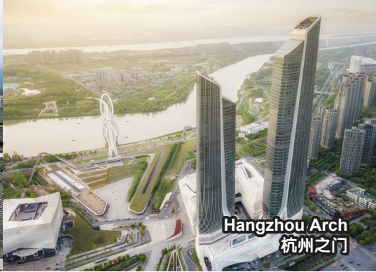
Hangzhou Arch 杭州之门