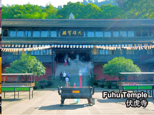
Fuhu Temple 伏虎寺