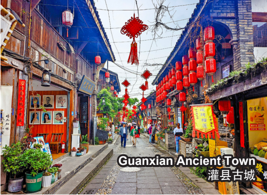
Guanxian Ancient Town 灌县古城