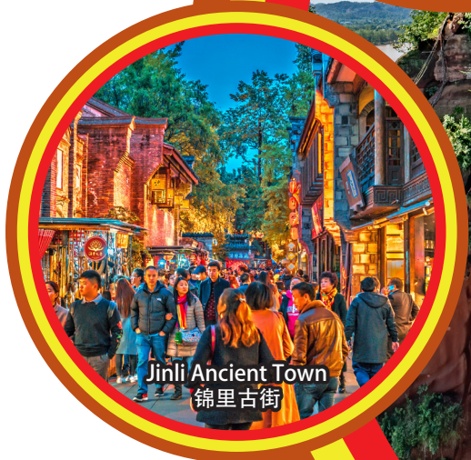
Jinli Ancient Town 锦里古街