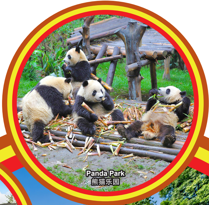
Panda Park 熊猫乐园