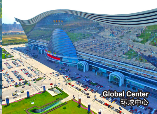
Global Center 环球中心