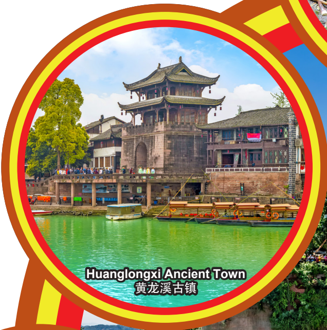
Huanglongxi Ancient Town 黄龙溪古镇