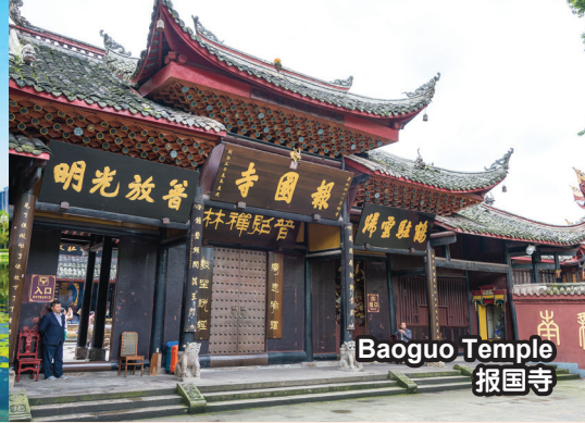
Baoguo Temple 报国寺