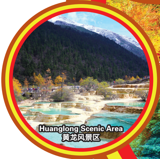
Huanglong Scenic Area 黄龙风景区

行程次序，以当地旅社安排为准。 Sequences of Itinerary are subject to local arrangement.