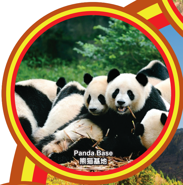
Panda Base 熊猫基地