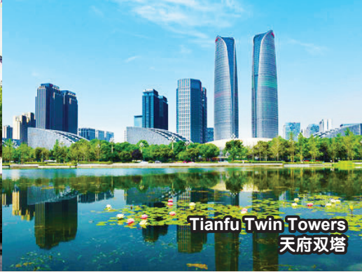
Tianfu Twin Towers 天府双塔