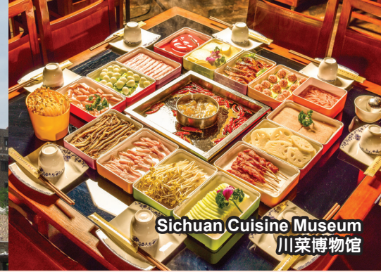
Sichuan Cuisine Museum 川菜博物馆