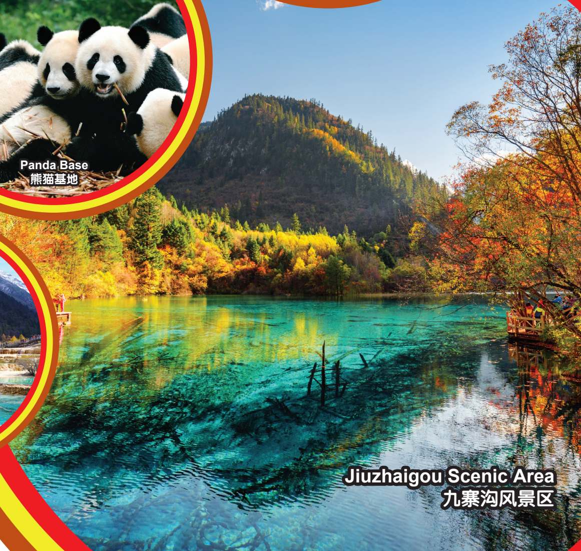
Jiuzhaigou Scenic Area 九寨沟风景区

行程次序，以当地旅社安排为准。 Sequences of Itinerary are subject to local arrangement.