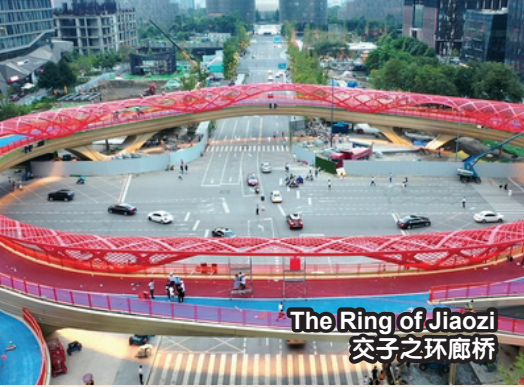
The Ring of Jiaozi 交子之环廊桥