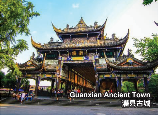
Guanxian Ancient Town 灌县古城