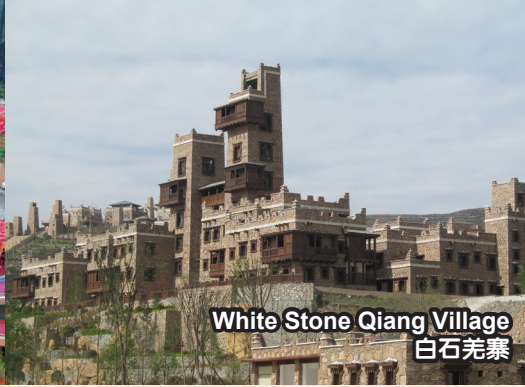
White Stone Qiang Village 白石羌寨