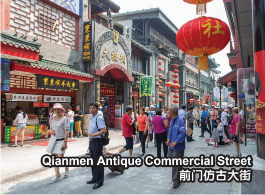
Qianmen Antique Commercial Street 前门仿古大街