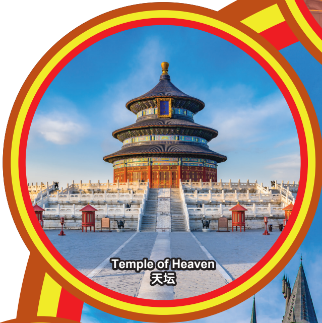
Temple of Heaven 天坛