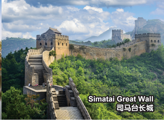
Simatai Great Wall 司马台长城