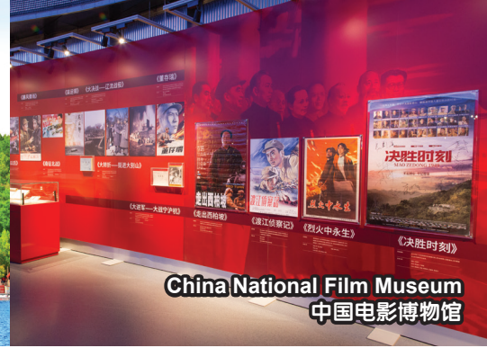
China National Film Museum 中国电影博物馆