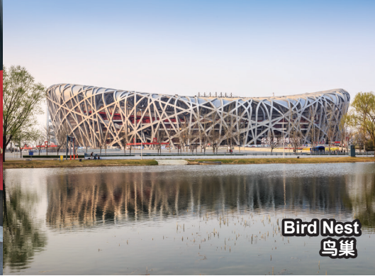
Bird Nest 鸟巢