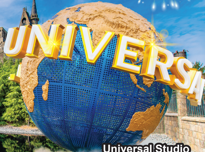
Universal Studio 环球影城

行程次序，以当地旅社安排为准。 Sequences of Itinerary are subject to local arrangement.