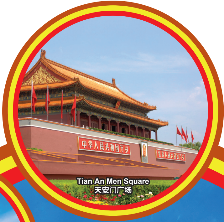
Tian An Men Square 天安门广场