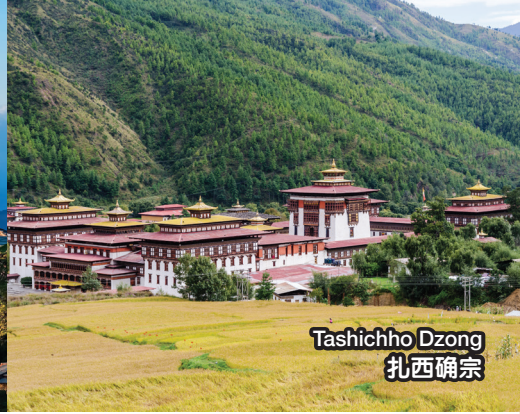
Tashichho Dzong 扎西确宗