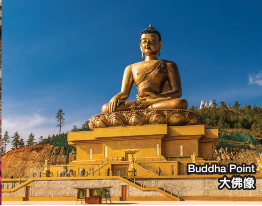
Buddha Point 大佛像