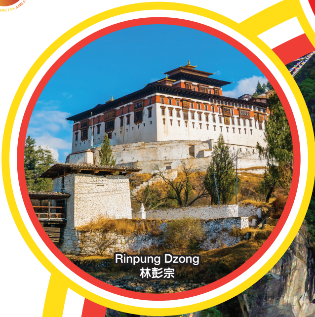
Rinpung Dzong 林彭宗