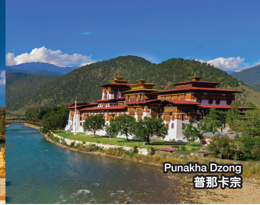
Punakha Dzong 普那卡宗