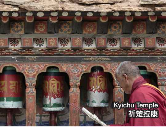
Kyichu Temple 祈楚拉康