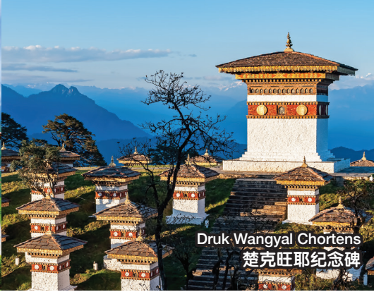
Druk Wangyal Chortens 楚克旺耶纪念碑