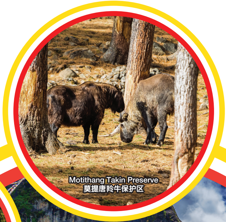
Motithang Takin Preserve 莫提唐羚牛保护区