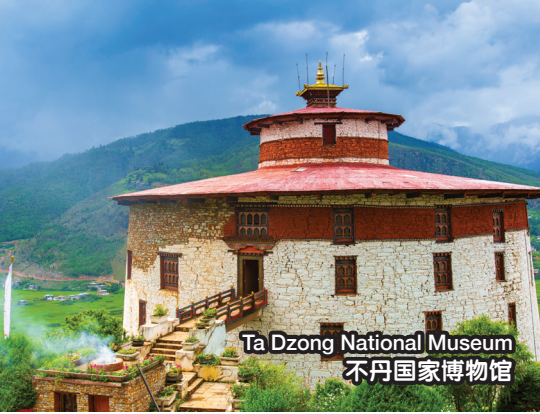
Ta Dzong National Museum 不丹国家博物馆