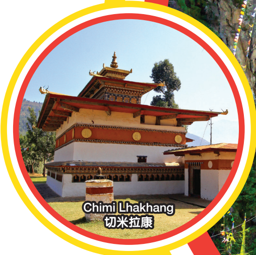
Chimi Lhakhang 切米拉康