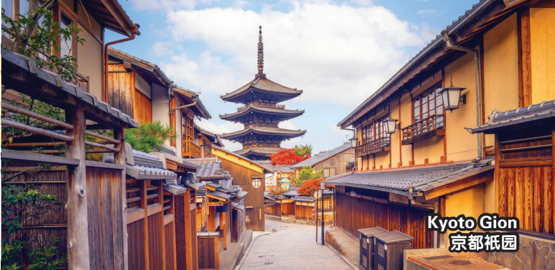
Kyoto Gion 京都祇园