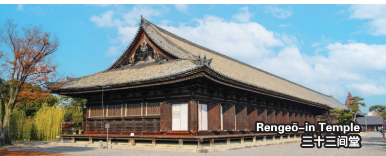
Rengeō-in Temple 三十三间堂

✓ Odysis Hotel or similar class x 1 Night