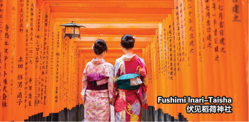
Fushimi Inari-Taisha 伏见稻荷神社