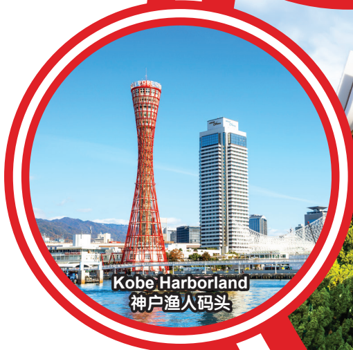
Kobe Harborland 神戸渔人码头