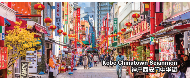
Kobe Chinatown Seianmon 神户西安门中华街