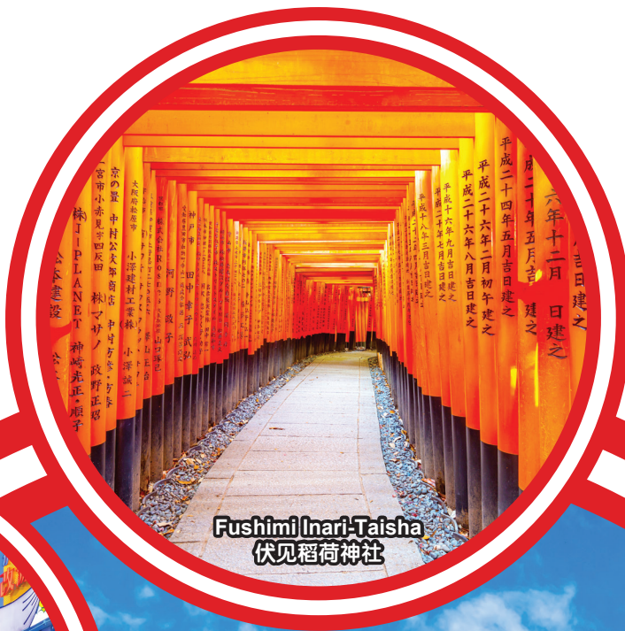
Fushimi Inari-Taisha 伏见稻荷神社