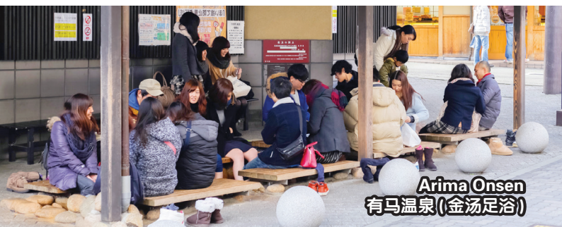
Arima Onsen 有马温泉(金汤足浴)

Disclaimer: Due to Covid-19 travel restrictions, local / religious festivals, public holidays, weather condition, transport technical issue, acts of nature, Golden Destinations reserved the right to alter the sequence or change, amend or alter the itinerary if necessary, with or without prior notice.