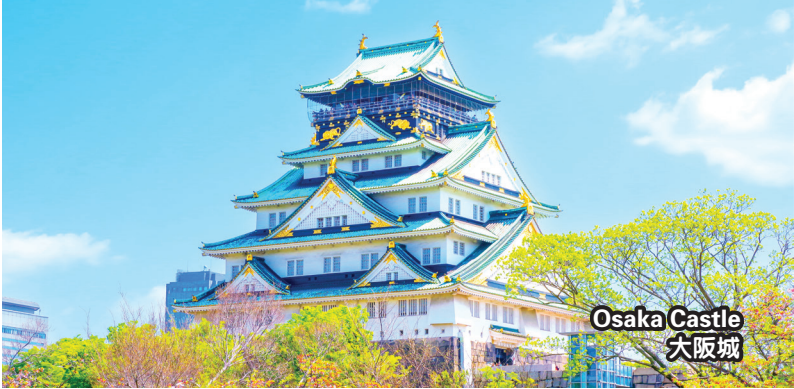
Osaka Castle 大阪城