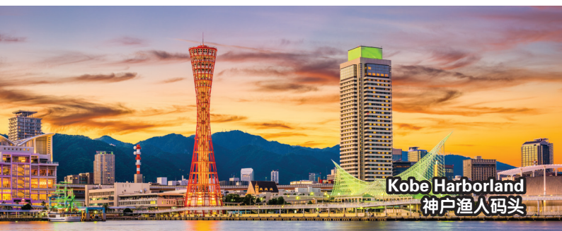
Kobe Harborland 神户渔人码头

免责声明：由于新冠肺炎疫情限制当地/宗教节日，公众假期，天气状况，交通等情况，自然灾害，必要时黄金旅程保留对行程进行适当调整 (调整景点游览顺序) 以确保行程顺利进行，会或否事先通知。