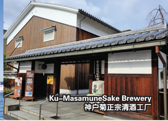
Ku-Masamune Sake Brewery 神戸菊正宗清酒工厂