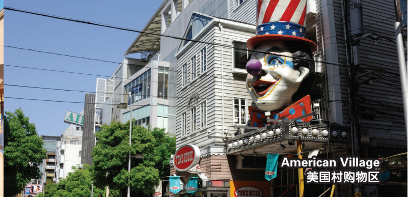
American Village 美国村购物区