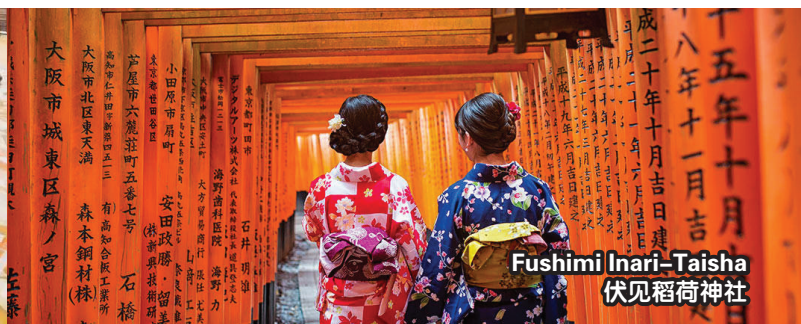
Fushimi Inari-Taisha 伏见稻荷神社

Disclaimer: Due to Covid-19 travel restrictions, local / religious festivals, public holidays, weather condition, transport technical issue, acts of nature, Golden Destinations reserved the right to alter the sequence or change, amend or alter the itinerary if necessary, with or without prior notice.