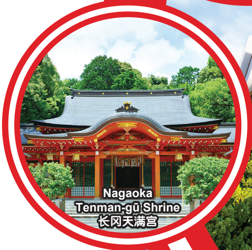
Nagaoka Tenman-gu Shrine 长冈天满宫