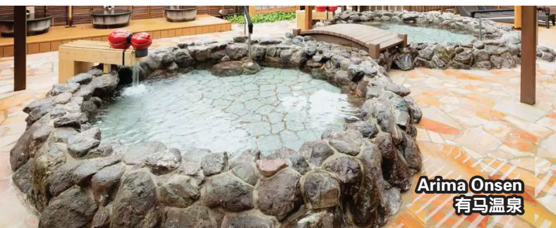
Arima Onsen 有马温泉