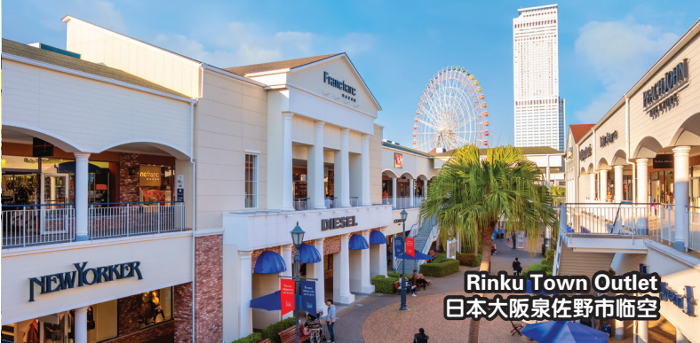
Rinku Town Outlet 日本大阪泉佐野市临空