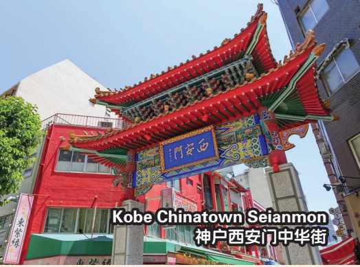
Kobe Chinatown Seianmon 神戸西安门中华街