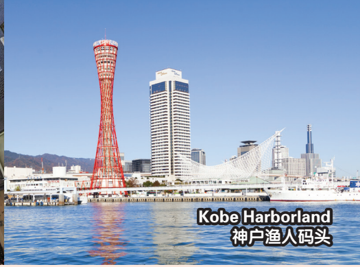
Kobe Harborland 神戸渔人码头