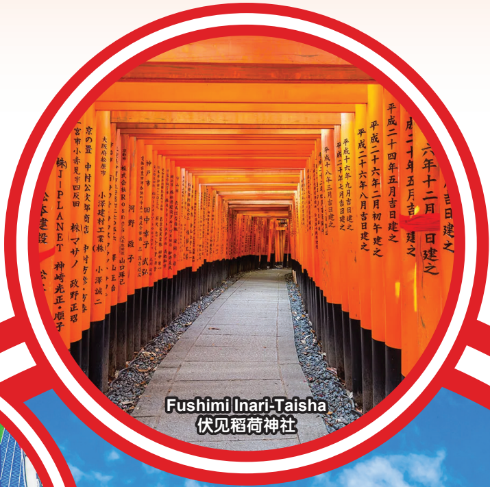
Fushimi Inari-Taisha 伏见稻荷神社