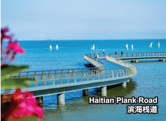
Haitian Plank Road 滨海栈道