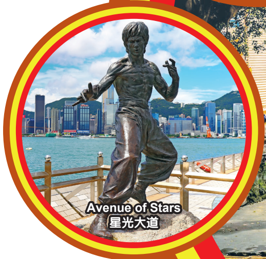
Avenue of Stars 星光大道