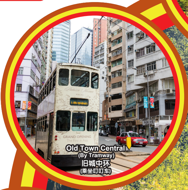
Old Town Central (By Tramway) 旧城中环 (乘坐叮叮车)