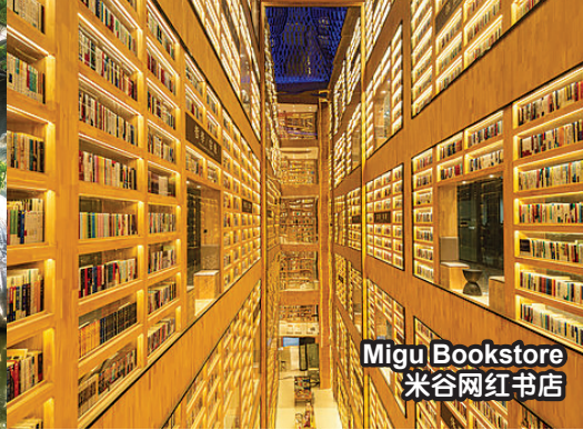
Migu Bookstore 米谷网红书店