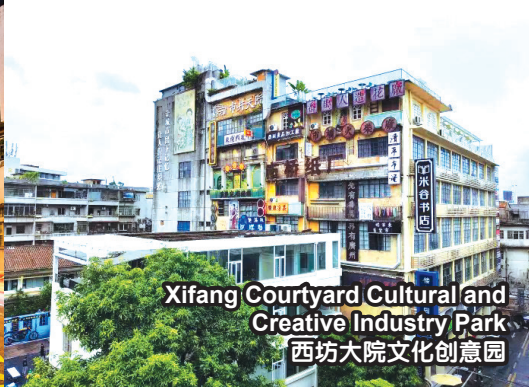
Xifang Courtyard Cultural and Creative Industry Park 西坊大院文化创意园