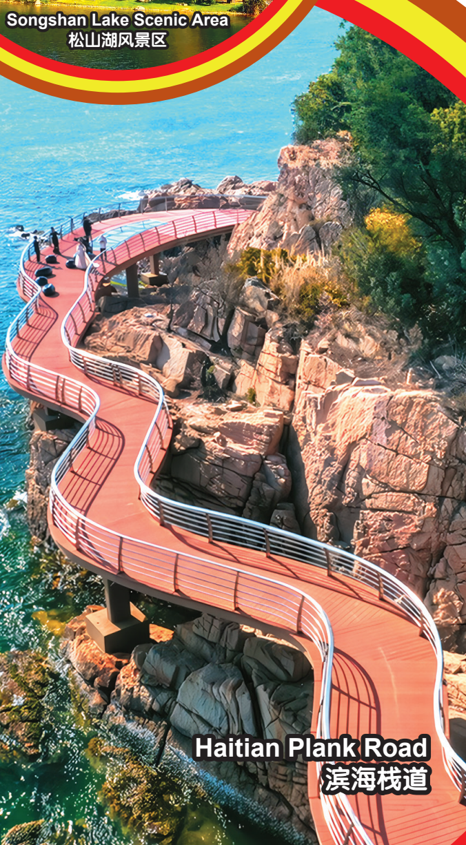
Haitian Plank Road 滨海栈道

行程次序，以当地旅社安排为准。 Sequences of Itinerary are subject to local arrangement.