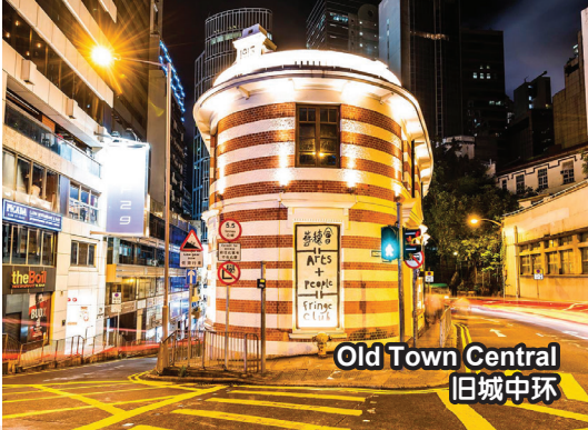
Old Town Central 旧城中环