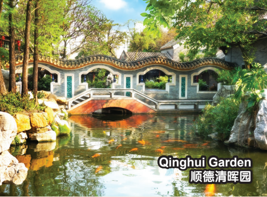
Qinghui Garden 顺德清晖园