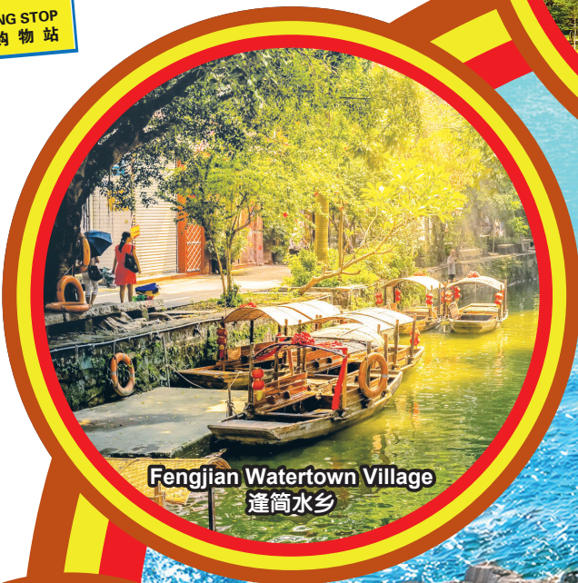
Fengjian Watertown Village 逢简水乡