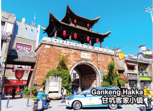
Gankeng Hakka 甘坑客家小镇