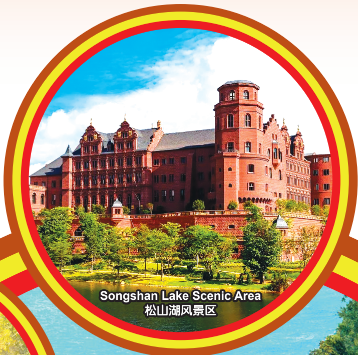
Songshan Lake Scenic Area 松山湖风景区