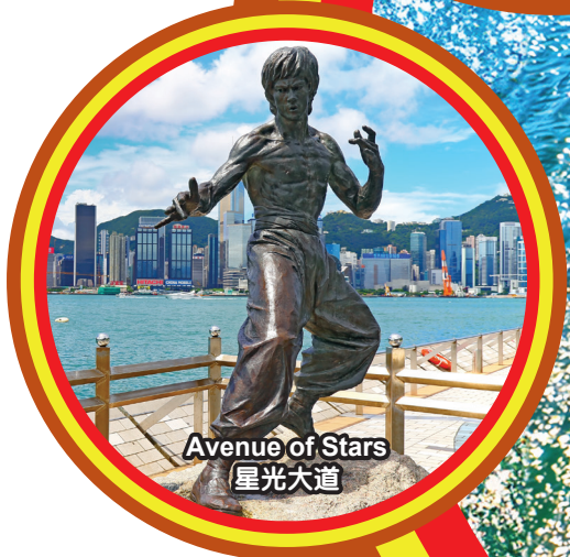
Avenue of Stars 星光大道