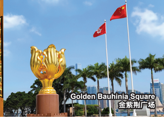
Golden Bauhinia Square 金紫荆广场