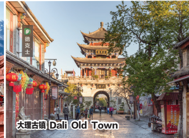
大理古镇 Dali Old Town