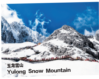
玉龙雪山 Yulong Snow Mountain