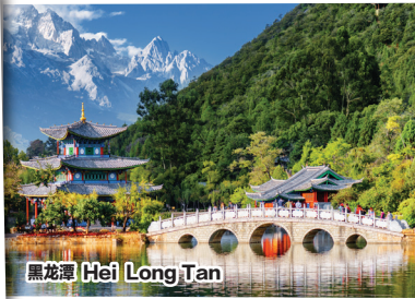
黑龙潭 Hei Long Tan