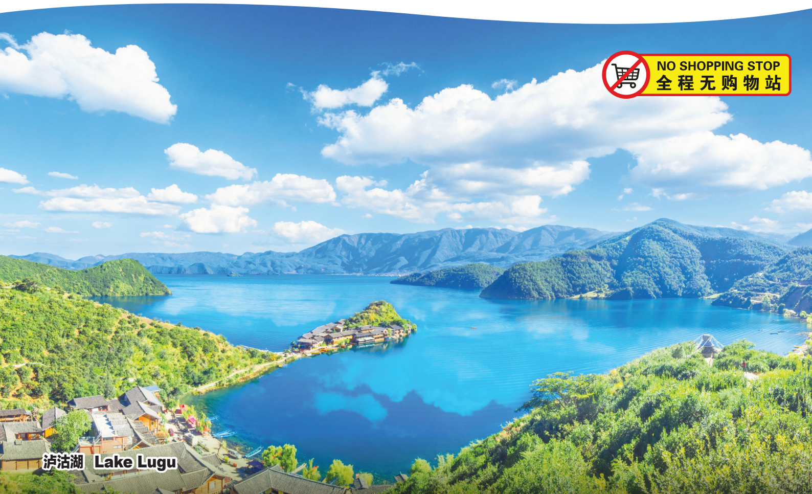
泸沽湖 Lake Lugu