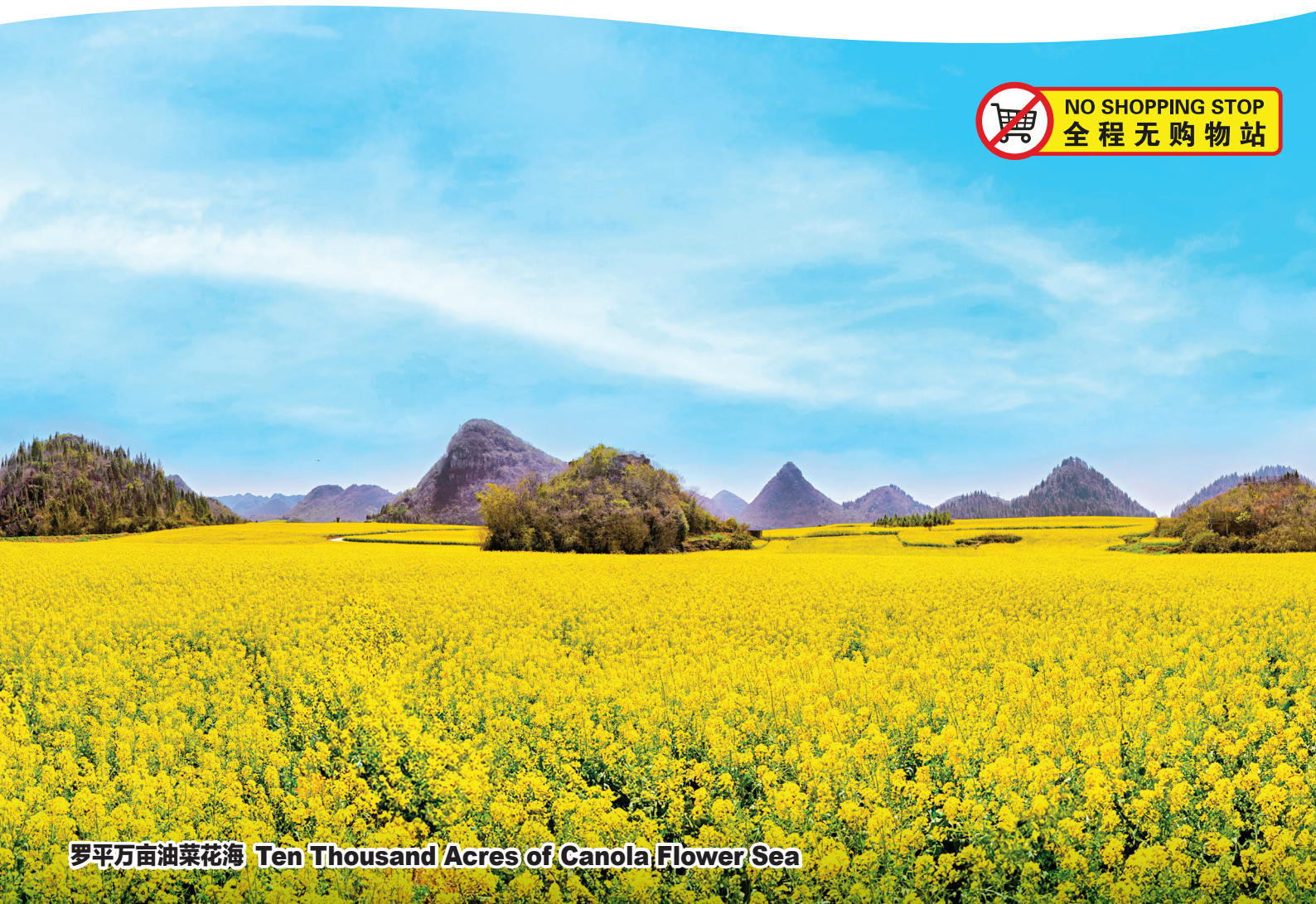
罗平万亩油菜花海 Ten Thousand Acres of Canola Flower Sea