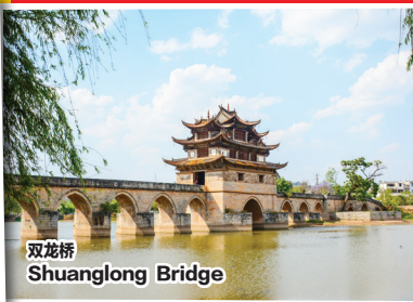
双龙桥 Shuanglong Bridge