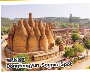
东风韵景区 Dongfengyun Scenic Spot