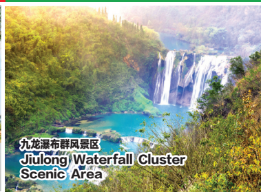
九龙瀑布群风景区 Jiulong Waterfall Cluster Scenic Area