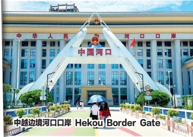
中越边境河口口岸 Hekou Border Gate