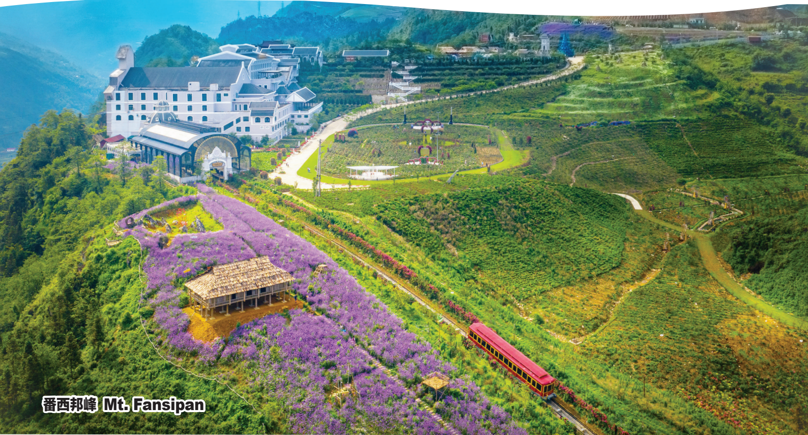
番西邦峰 Mt. Fansipan