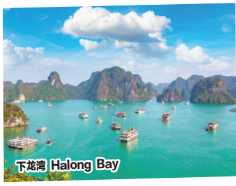
下龙湾 Halong Bay