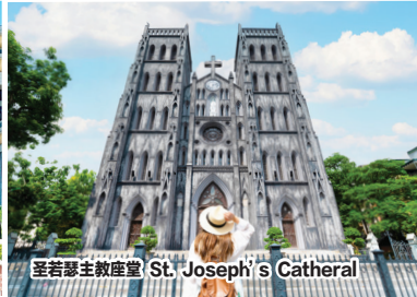
圣若瑟主教座堂 St. Joseph's Cathedral