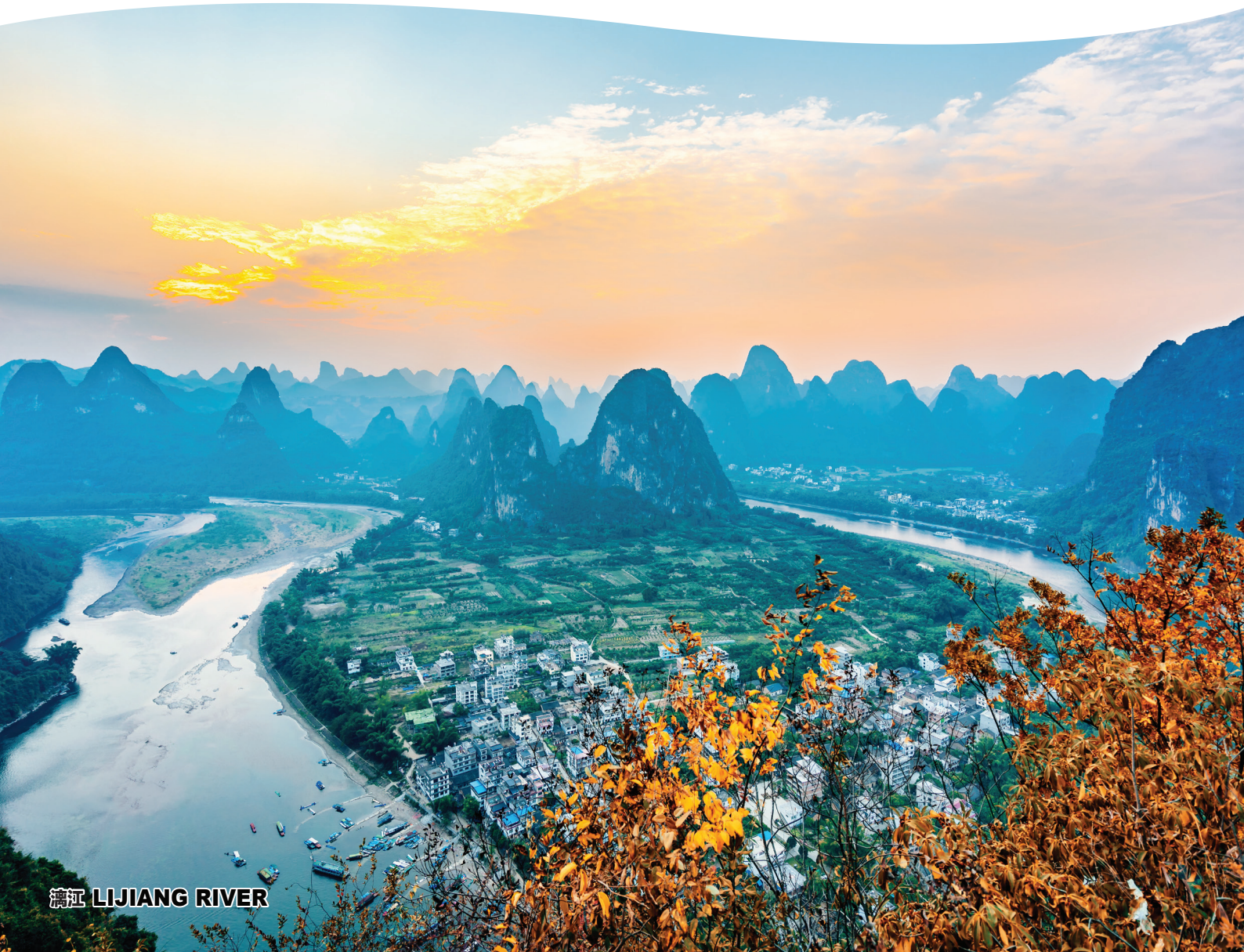
漓江 LIJIANG RIVER