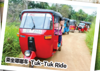
乘坐嘟嘟车 Tuk-Tuk Ride