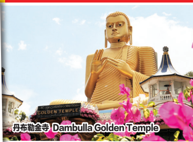
丹布勒金寺 Dambulla Golden Temple