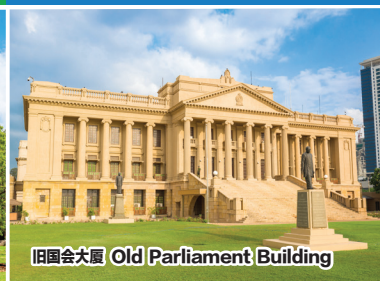
旧国会大厦 Old Parliament Building