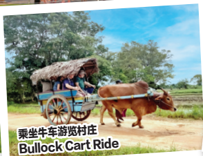
乘坐牛车游览村庄 Bullock Cart Ride