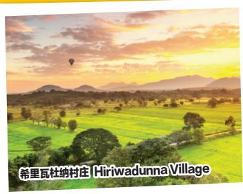
希里瓦杜纳村庄 Hiriwadunna Village