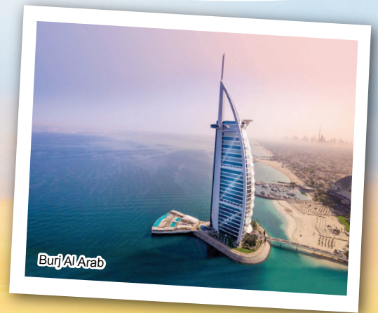
Burj Al Arab