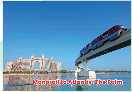
Monorail to Atlantis, The Palm