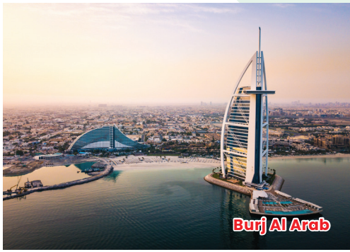
Burj Al Arab