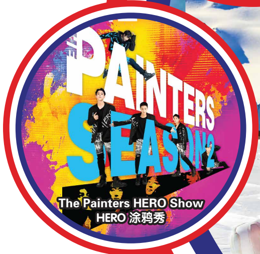
The Painters HERO Show HERO 涂鸦秀