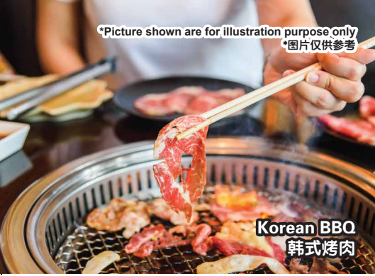
Korean BBO 韩式烤肉

*Picture shown are for illustration purpose only *图片仅供参考