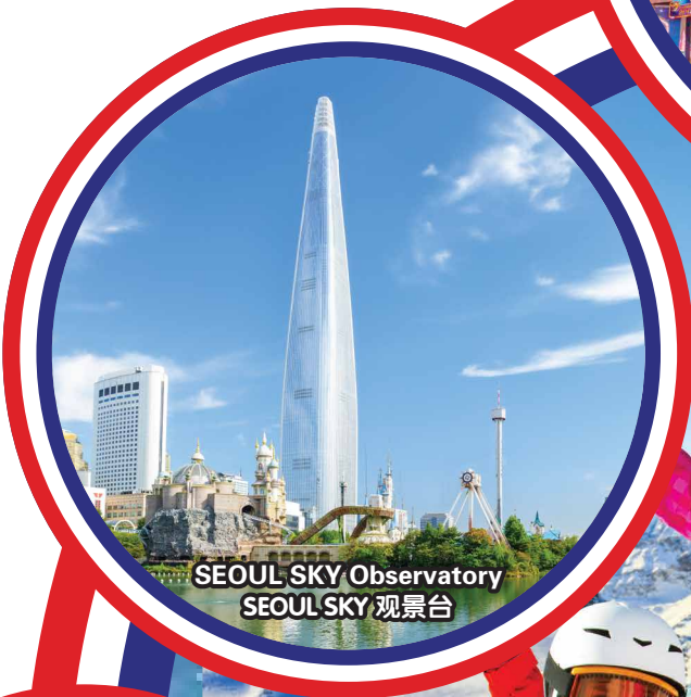
SEOUL SKY Observatory SEOUL SKY 观景台