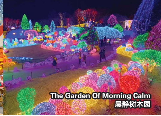
The Garden Of Morning Calm 晨静树木园