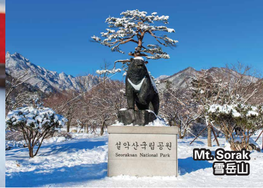
Mt. Sorak 雪岳山