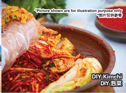
DIY Kimchi DIY 泡菜