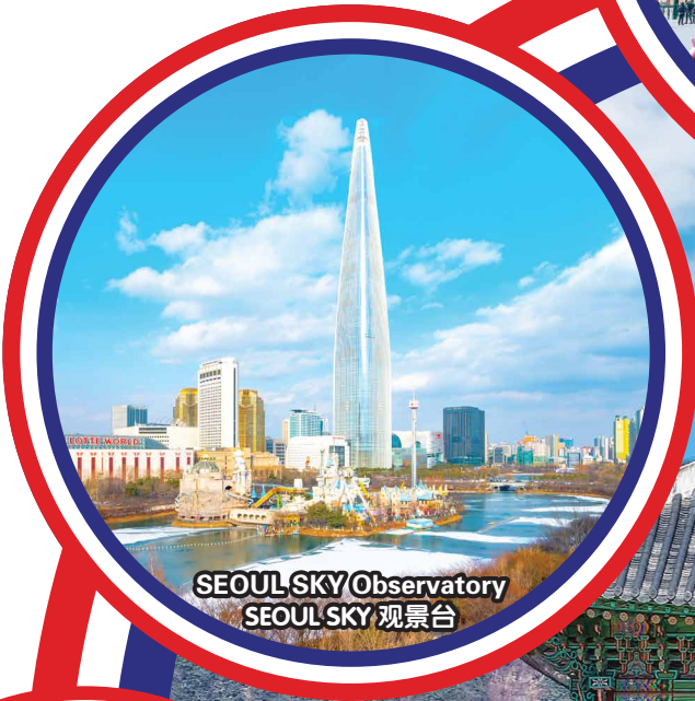
SEOUL SKY Observatory SEOUL SKY 观景台