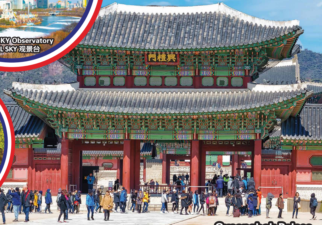
Gyeongbok Palace 景福宫

行程次序，以当地旅社安排为准。 Sequences of Itinerary are subject to local arrangement.