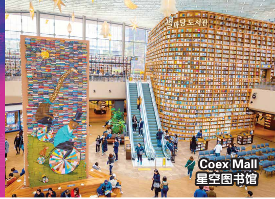
Coex Mall 星空图书馆