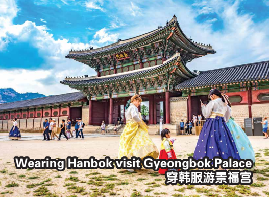
Wearing Hanbok visit Gyeongbok Palace 穿韩服游景福宫