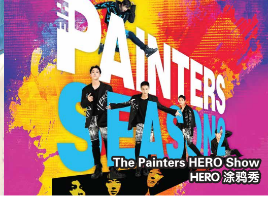
The Painters HERO Show HERO 涂鸦秀