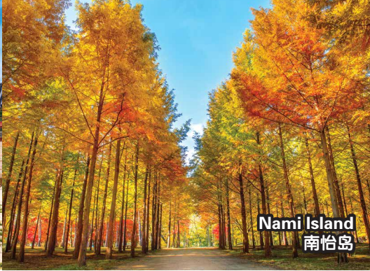
Nami Island 南怡岛