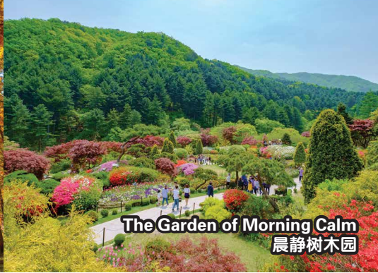
The Garden of Morning Calm 晨静树木园