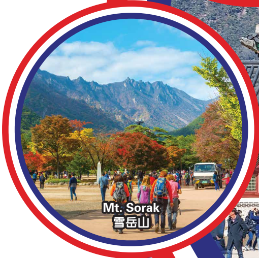
Mt. Sorak 雪岳山