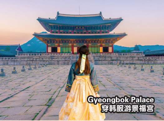
Gyeongbok Palace 穿韩服游景福宫