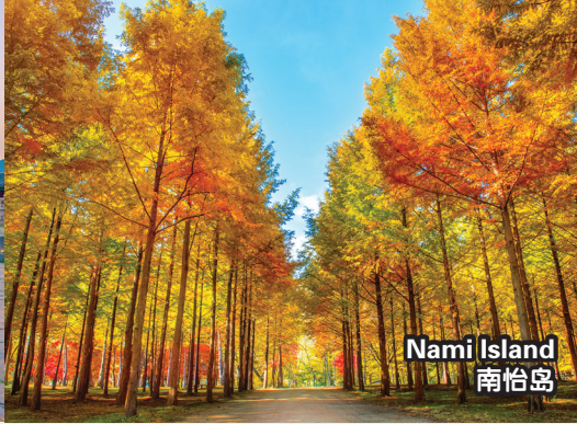
Nami Island 南怡岛