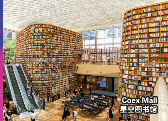
Coex Mall 星空图书馆