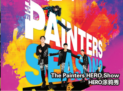
The Painters HERO Show HERO涂鸦秀