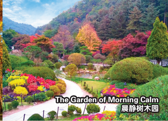
The Garden of Morning Calm 晨静树木园