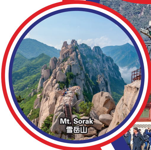
Mt. Sorak 雪岳山