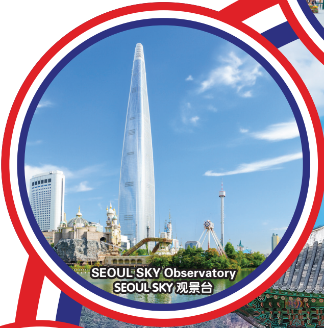
SEOUL SKY Observatory SEOUL SKY 观景台