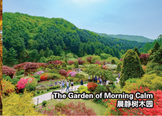
The Garden of Morning Calm 晨静树木园