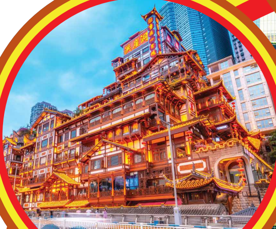
HongYa Cave Scenic Area 洪崖洞风景区