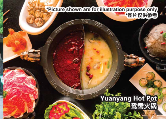
Yuanyang Hot Pot 鸳鸯火锅