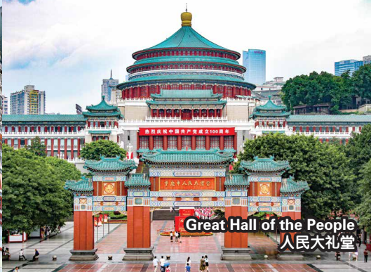
Great Hall of the People 人民大礼堂