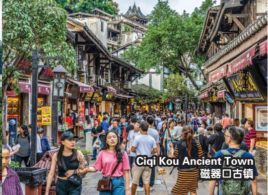
Ciqi Kou Ancient Town 磁器口古镇