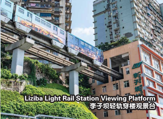
Liziba Light Rail Station Viewing Platform 李子坝轻轨穿楼观景台