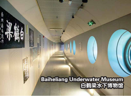
Baiheliang Underwater Museum 白鹤梁水下博物馆