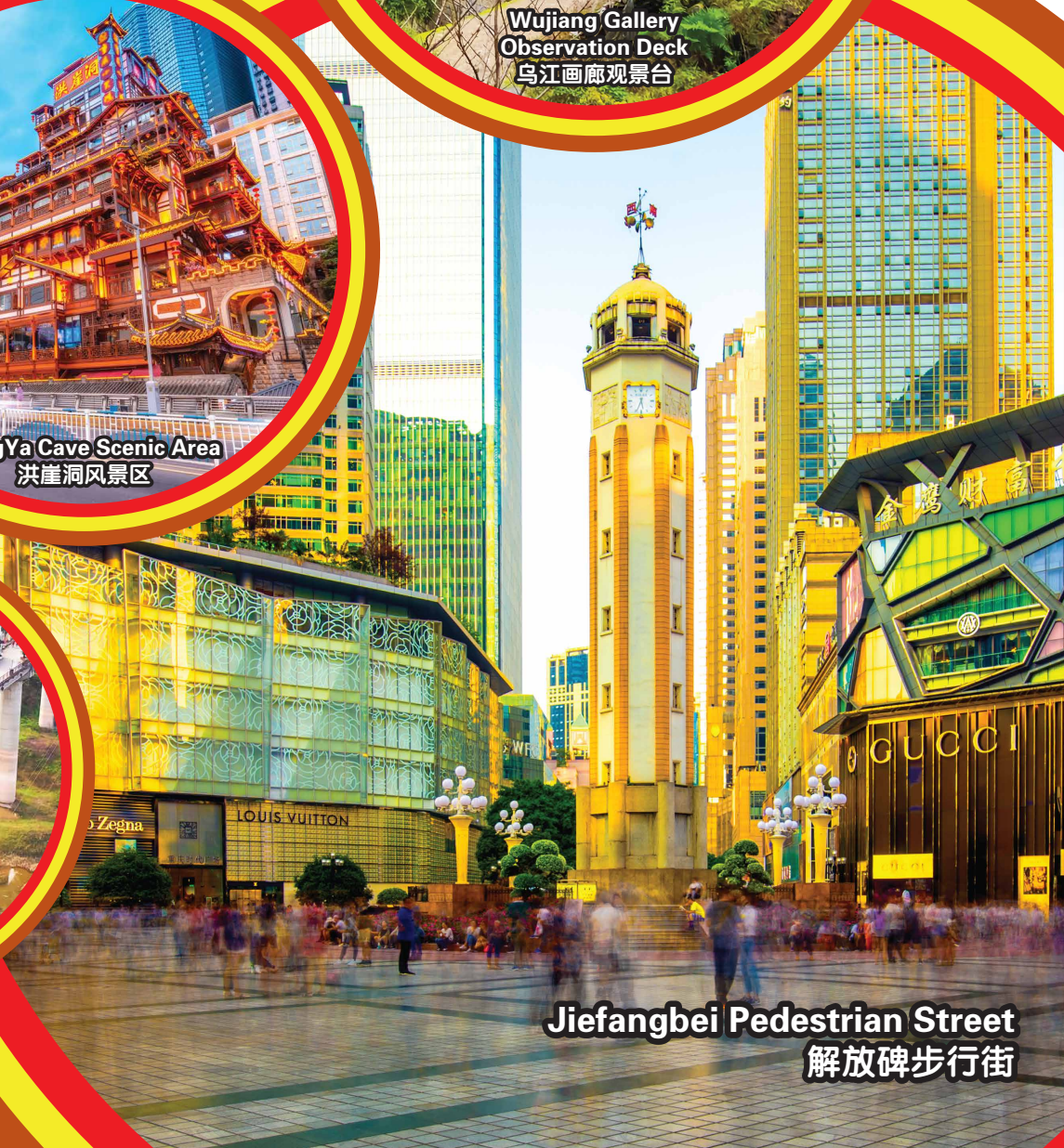
Jiefangbei Pedestrian Street 解放碑步行街

行程次序，以当地旅社安排为准。 Sequences of Itinerary are subject to local arrangement.