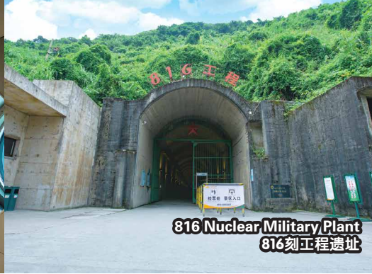
816 Nuclear Military Plant 816刻工程遗址