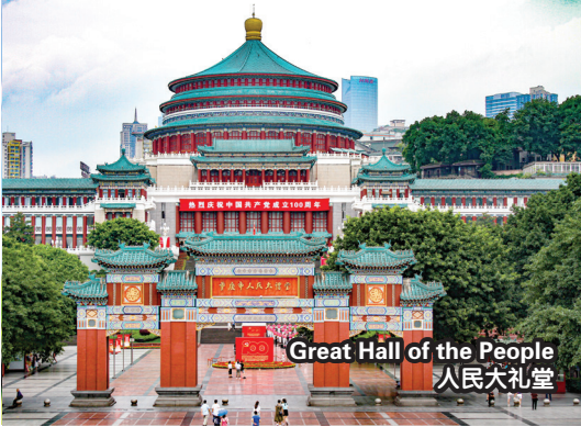
Great Hall of the People 人民大礼堂