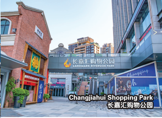
Changjiahui Shopping Park 长嘉汇购物公园