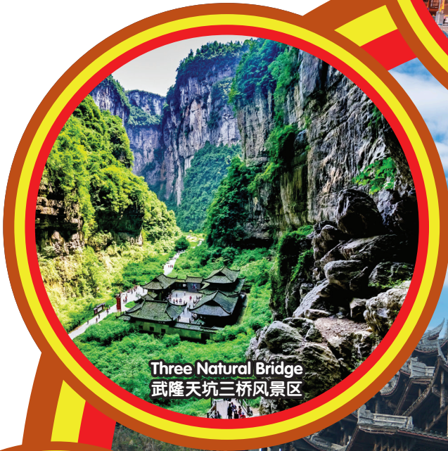
Three Natural Bridge 武隆天坑三桥风景区