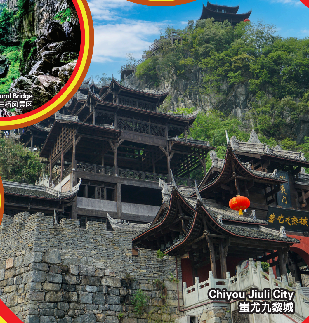
Chiyou Jiuli City 蚩尤九黎城

行程次序，以当地旅社安排为准。 Sequences of Itinerary are subject to local arrangement.