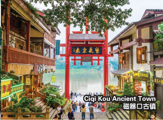
Ciqi Kou Ancient Town 磁器口古镇