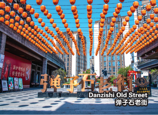
Danzhi Old Street 弹子石老街