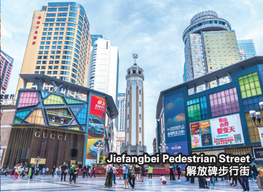
Jiefangbei Pedestrian Street 解放碑步行街