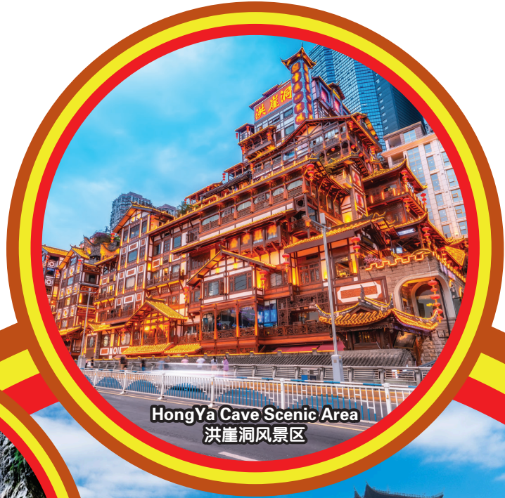
HongYa Cave Scenic Area 洪崖洞风景区