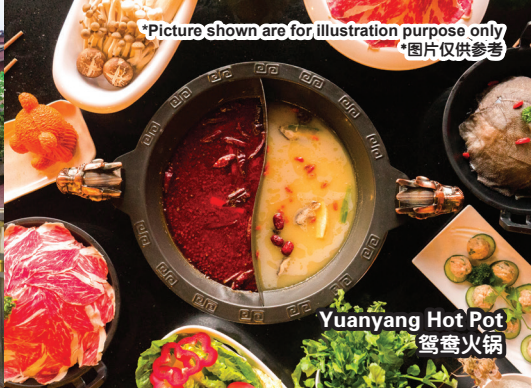
Yuanyang Hot Pot 鸳鸯火锅