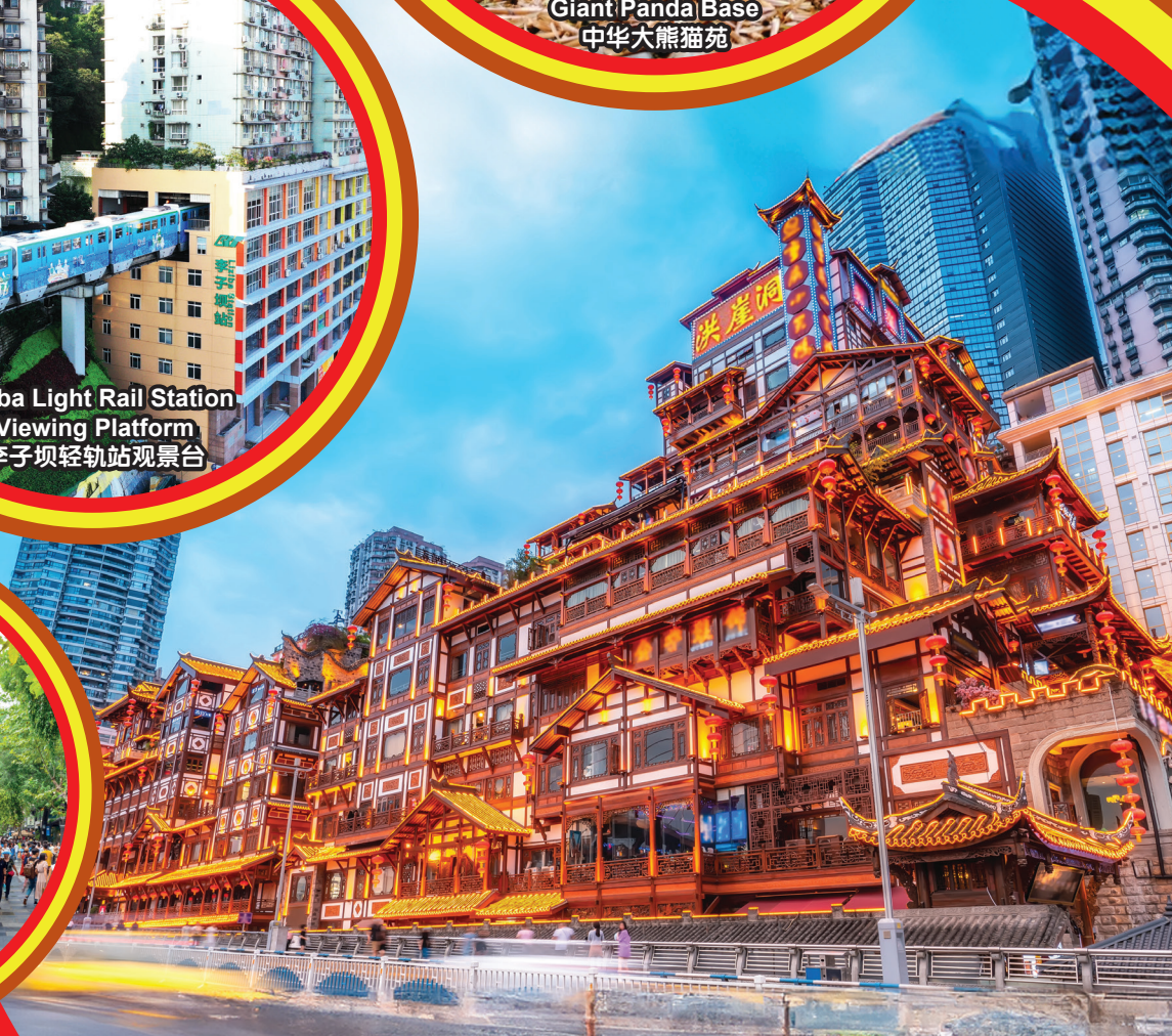
Hongya Cave Scenic Area 洪崖洞风景区

行程次序，以当地旅社安排为准。 Sequences of Itinerary are subject to local arrangement.