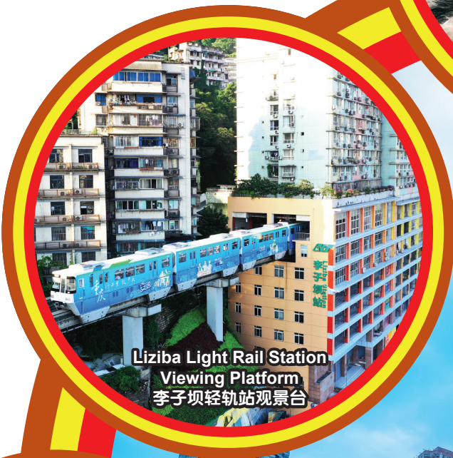
Liziba Light Rail Station Viewing Platform 李子坝轻轨站观景台