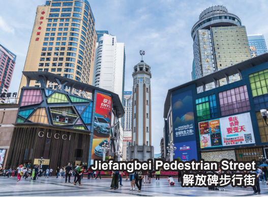
Jiefangbei Pedestrian Street 解放碑步行街