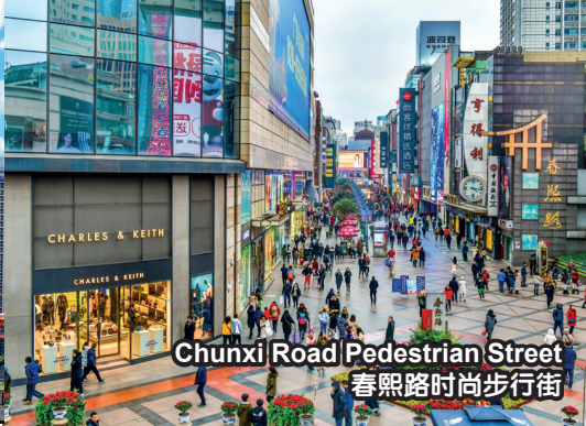
Chunxi Road Pedestrian Street 春熙路时尚步行街