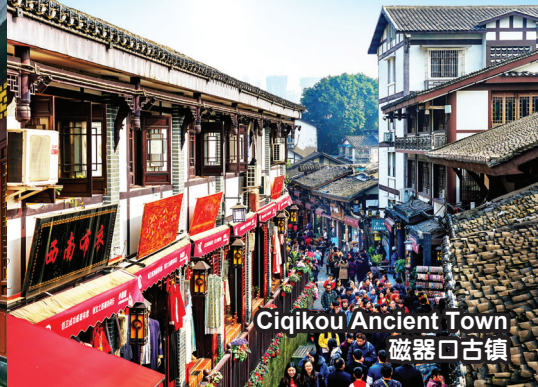
Ciqikou Ancient Town 磁器口古镇