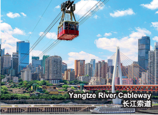
Yangtze River Cableway 长江索道