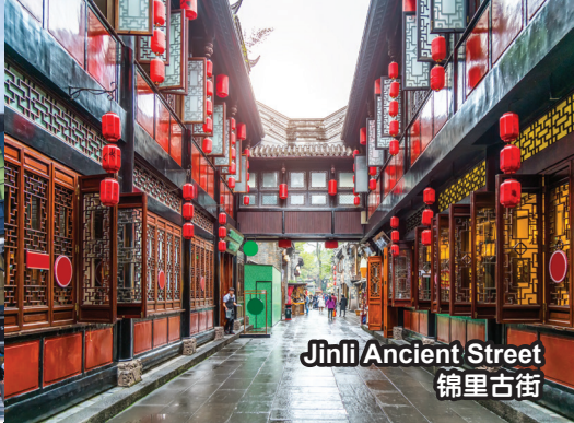
Jinli Ancient Street 锦里古街