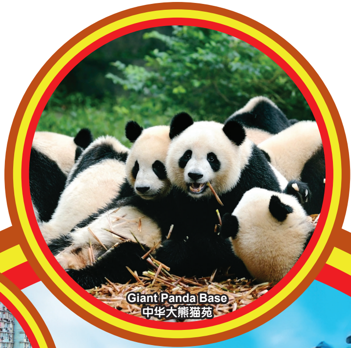
Giant Panda Base 中华大熊猫苑