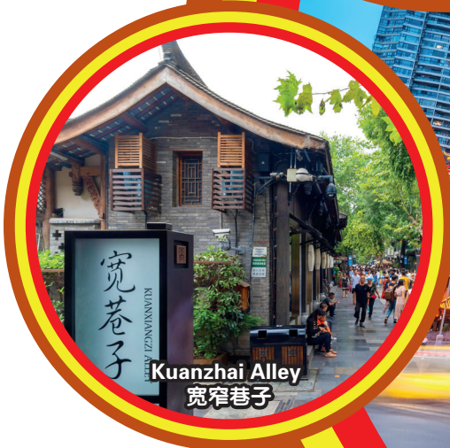
宽窄巷子 KUANZHAI ALLEY 宽窄巷子