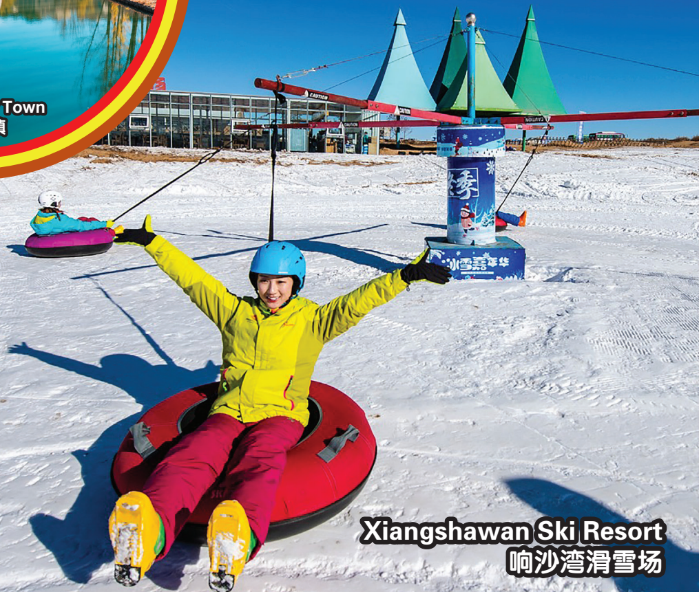
Xiangshawan Ski Resort 响沙湾滑雪场

行程次序, 以当地旅社安排为准。 Sequences of Itinerary are subject to local arrangement.