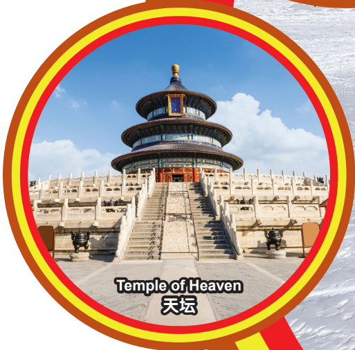
Temple of Heaven 天坛