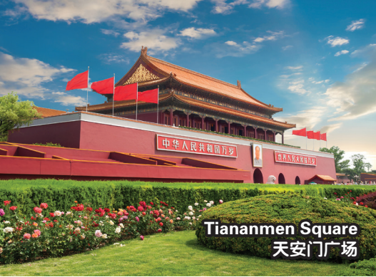
Tiananmen Square 天安门广场