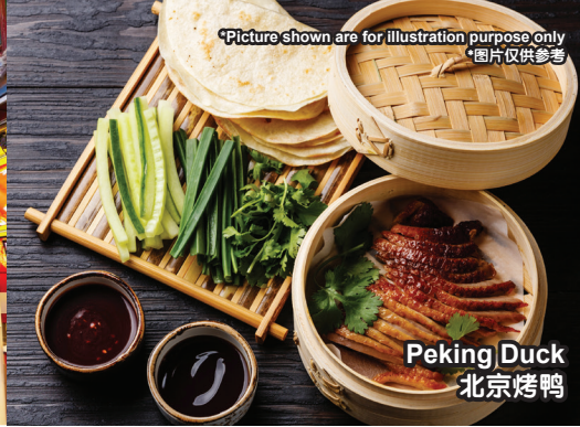
Peking Duck 北京烤鸭