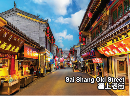
Sai Shang Old Street 塞上老街