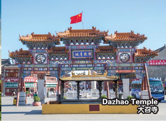
Dazhao Temple 大召寺