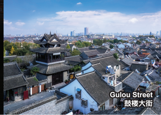
Gulou Street 鼓楼大街