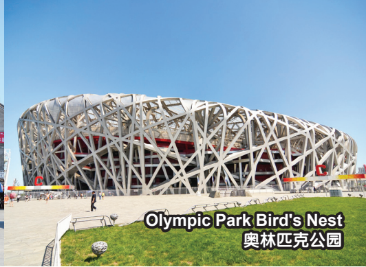
Olympic Park Bird's Nest 奥林匹克公园