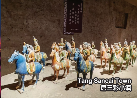
Tang Sancai Town 唐三彩小镇