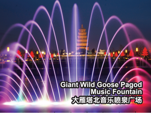
Giant Wild Goose Pagoda Music Fountain 大雁塔北音乐喷泉广场