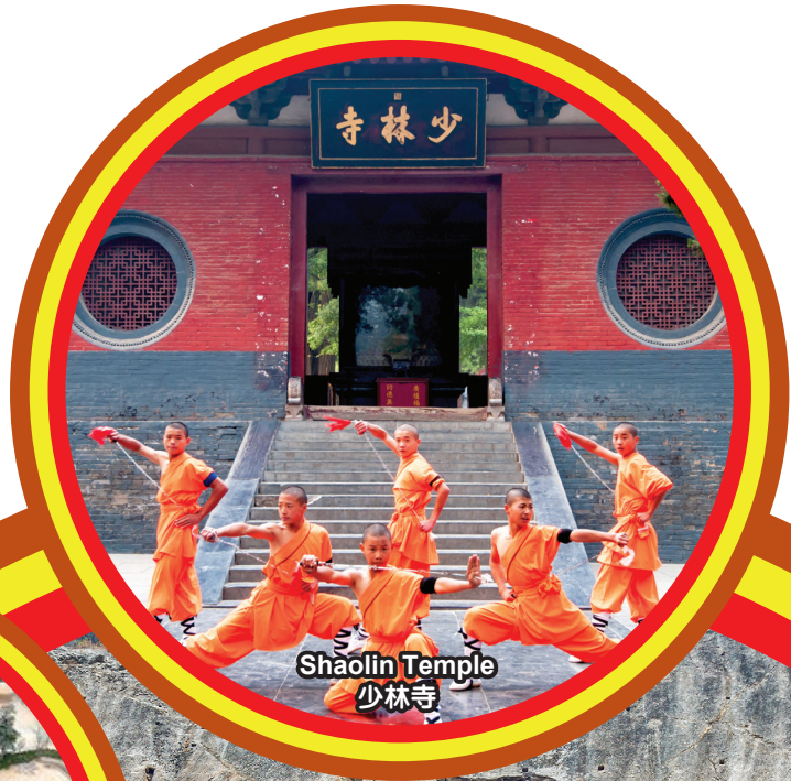
Shaolin Temple 少林寺