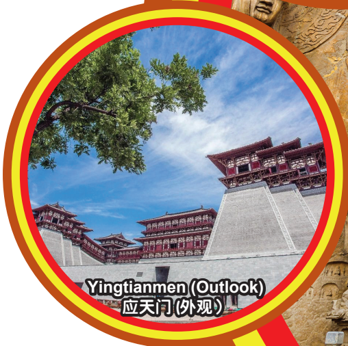
Yingtianmen (Outlook) 应天门(外观)