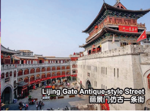
Lijing Gate Antique-style Street 丽景门仿古一条街