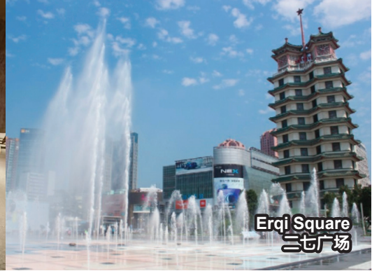
Erqi Square 二七广场