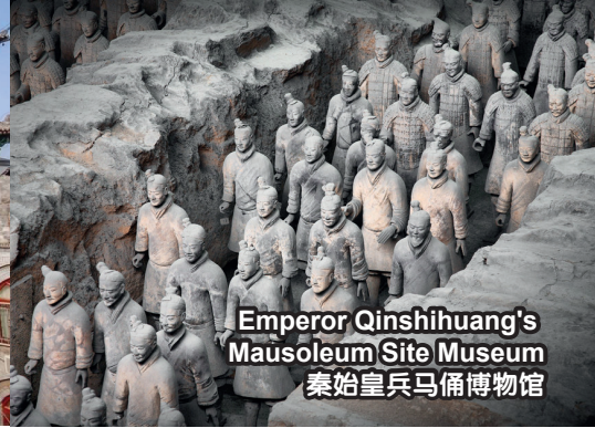
Emperor Qinshihuang's Mausoleum Site Museum 秦始皇兵马俑博物馆