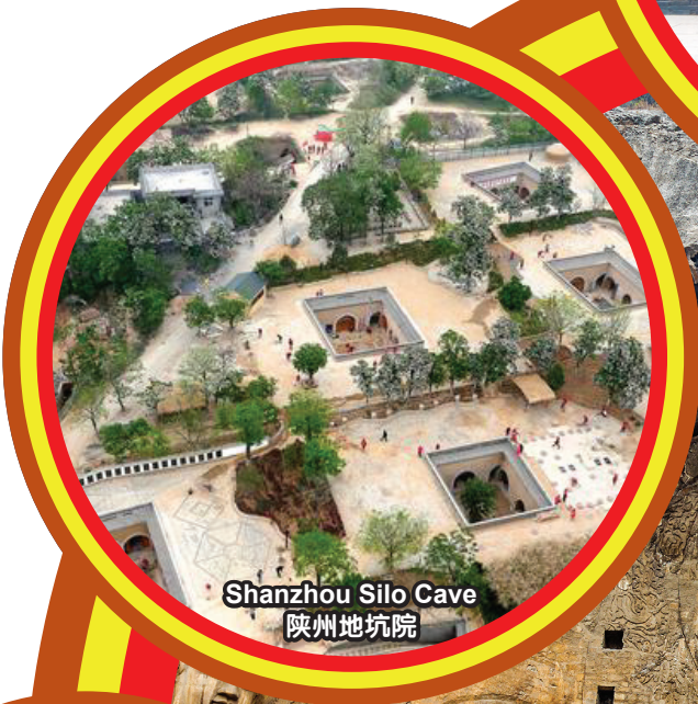
Shanzhou Silo Cave 陕州地坑院