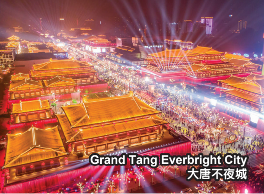
Grand Tang Everbright City 大唐不夜城