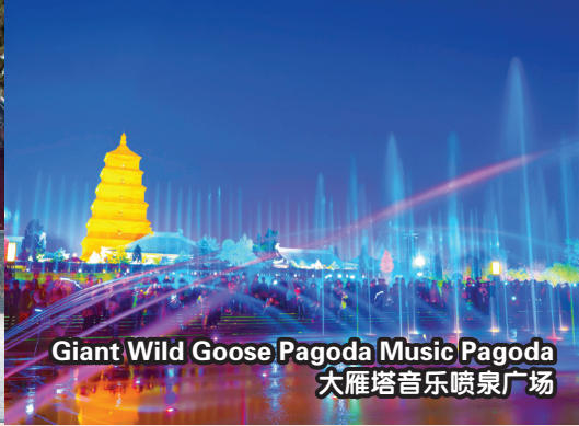
Giant Wild Goose Pagoda Music Pagoda 大雁塔音乐喷泉广场