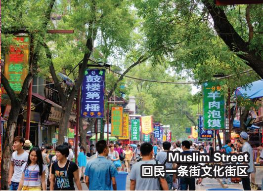
Muslim Street 回民一条街文化街区