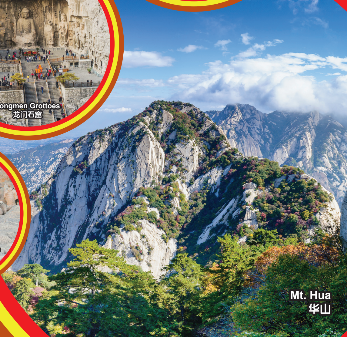
Mt. Hua 华山

行程次序，以当地旅社安排为准。 Sequences of Itinerary are subject to local arrangement.