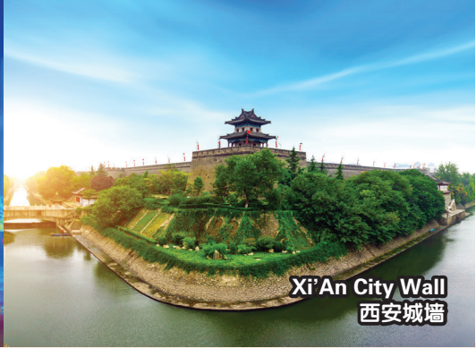
Xi'An City Wall 西安城墙