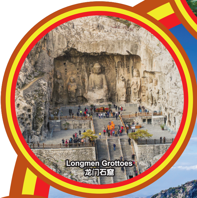
Longmen Grottoes 龙门石窟