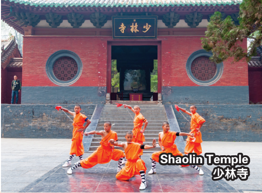
Shaolin Temple 少林寺