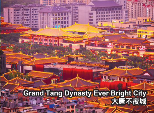
Grand Tang Dynasty Ever Bright City 大唐不夜城