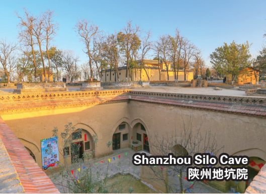
Shanzhou Silo Cave 陕州地坑院