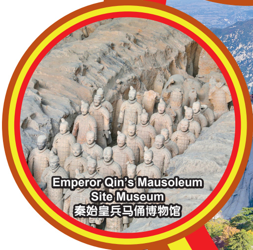
Emperor Qin's Mausoleum Site Museum 秦始皇兵马俑博物馆