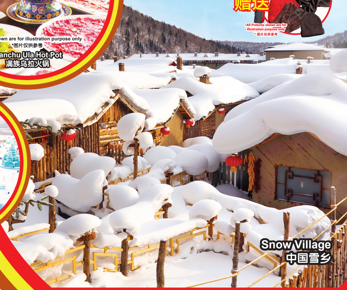
Snow Village 中国雪乡