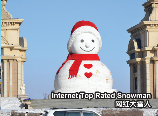
Internet Top Rated Snowman 网红大雪人