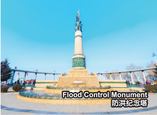
Flood Control Monument 防洪纪念塔