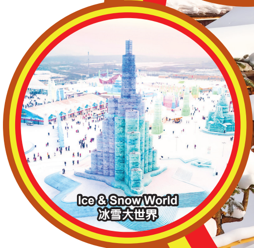
Ice & Snow World 冰雪大世界

*All Pictures shown are for illustration purpose only *图片仅供参考