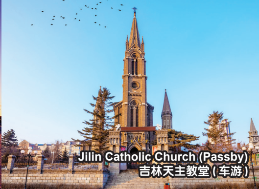
Jilin Catholic Church (Passby) 吉林天主教堂 (车游)