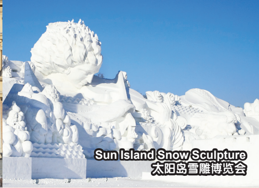
Sun Island Snow Sculpture 太阳岛雪雕博览会