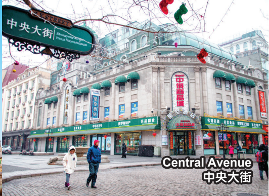
Central Avenue 中央大街