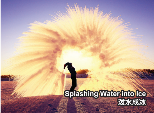
Splashing Water into Ice 泼水成冰