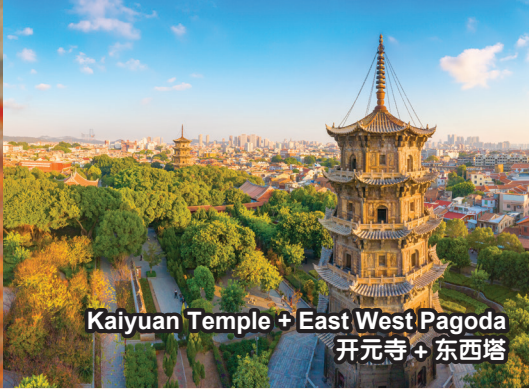
Kaiyuan Temple + East West Pagoda 开元寺 + 东西塔