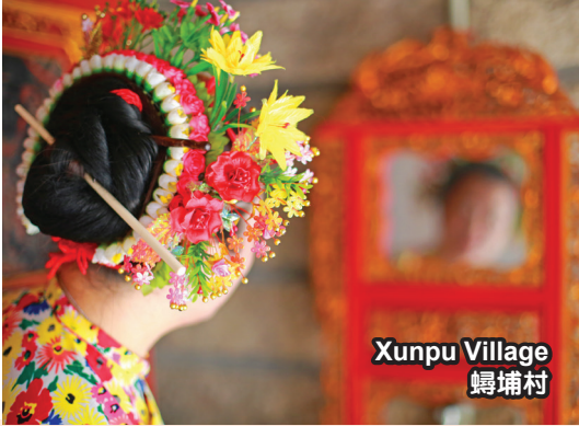
Xunpu Village 蟳埔村