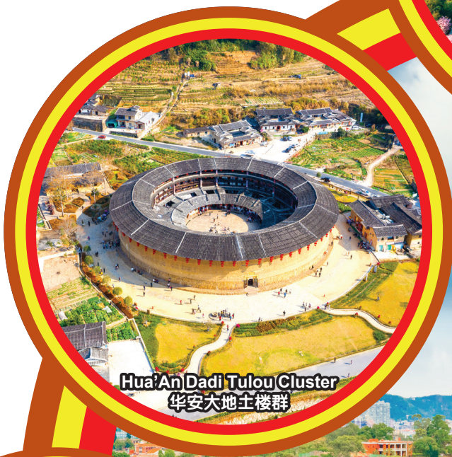
Hua'An Dadi Tulou Cluster 华安大地土楼群