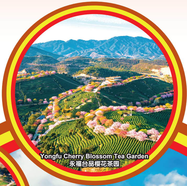
Yongfu Cherry Blossom Tea Garden 永福台品樱花茶园