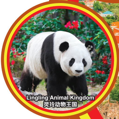
Lingling Animal Kingdom 灵玲动物王国