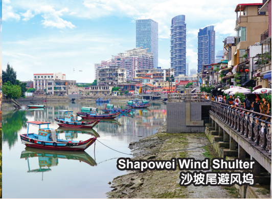
Shapowei Wind Shelter 沙坡尾避风坞