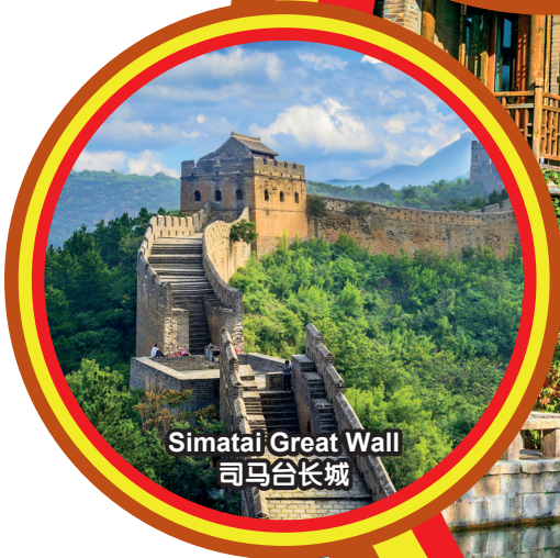
Simatai Great Wall 司马台长城