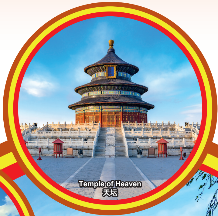
Temple of Heaven 天坛