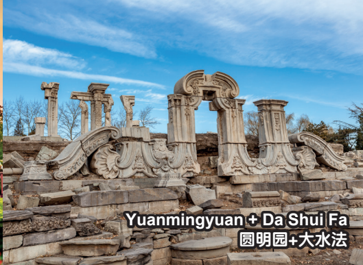
Yuanmingyuan + Da Shui Fa 圆明园+大水法