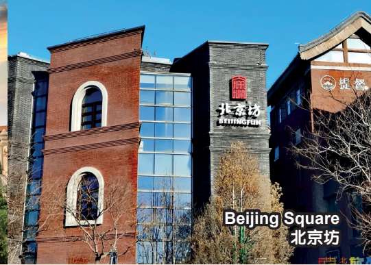
Beijing Square 北京坊