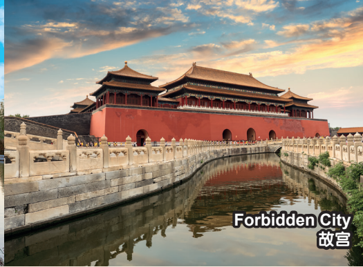
Forbidden City 故宫