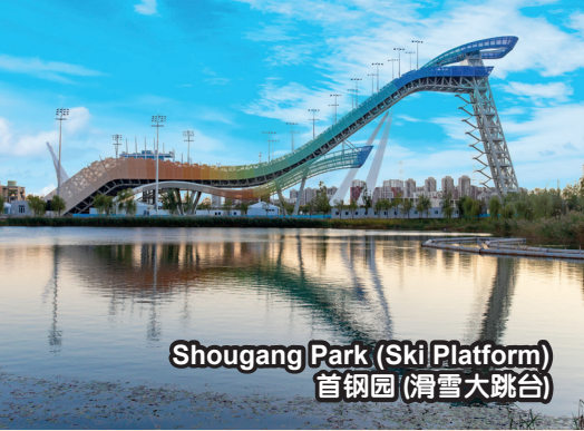
Shougang Park (Ski Platform) 首钢园 (滑雪大跳台)