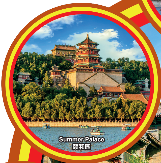
Summer Palace 颐和园