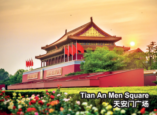
Tian An Men Square 天安门广场