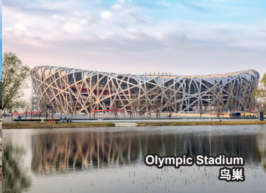
Olympic Stadium 鸟巢