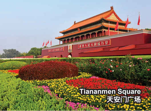
Tiananmen Square 天安门广场