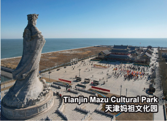
Tianjin Mazu Cultural Park 天津妈祖文化园