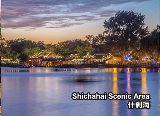
Shichahai Scenic Area 什刹海