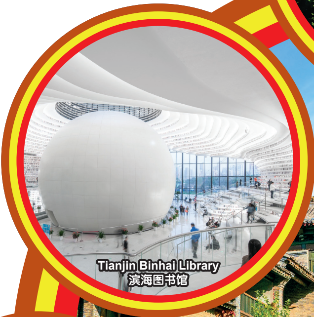
Tianjin Binhai Library 滨海图书馆