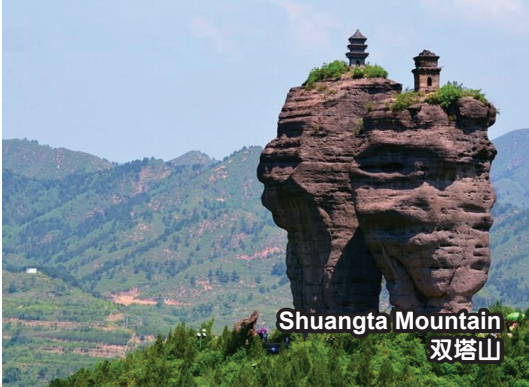
Shuangta Mountain 双塔山