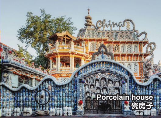
Porcelain house 瓷房子