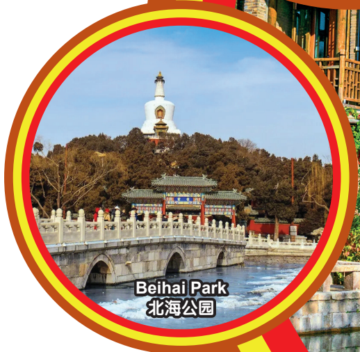
Beihai Park 北海公园