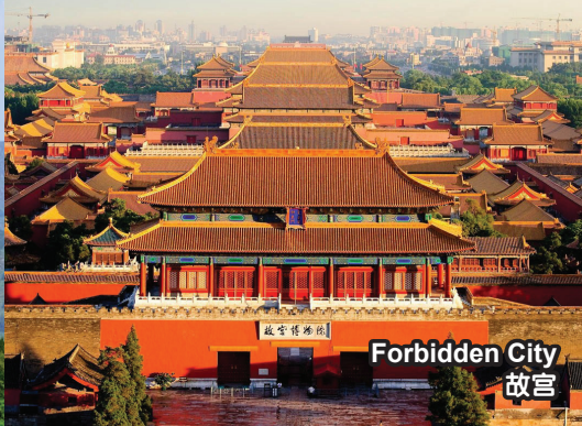
Forbidden City 故宫