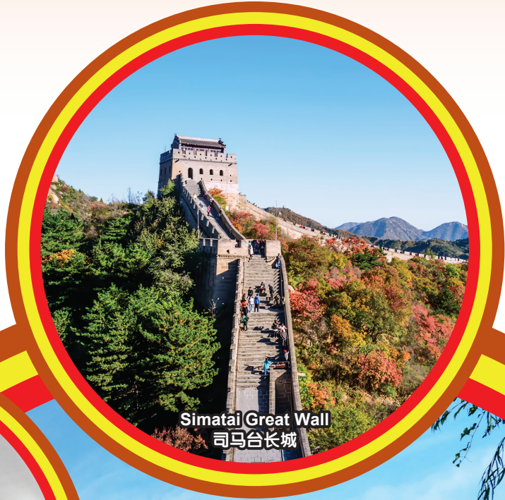
Simatai Great Wall 司马台长城