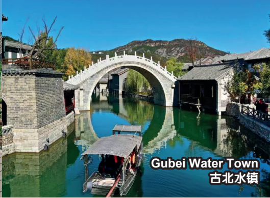
Gubei Water Town 古北水镇