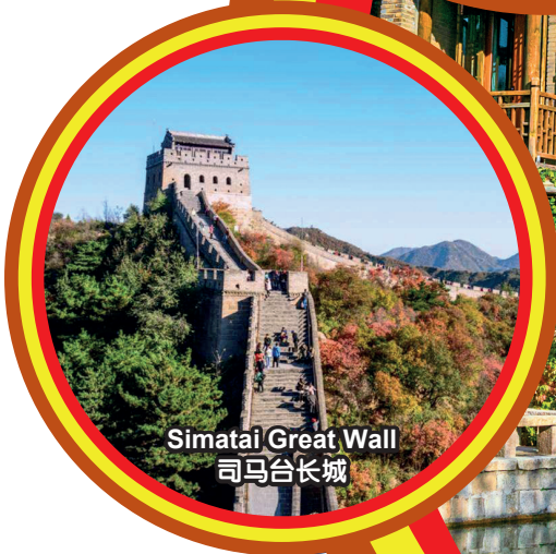
Simatai Great Wall 司马台长城