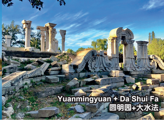
Yuanmingyuan + Da Shui Fa 圆明园+大水法