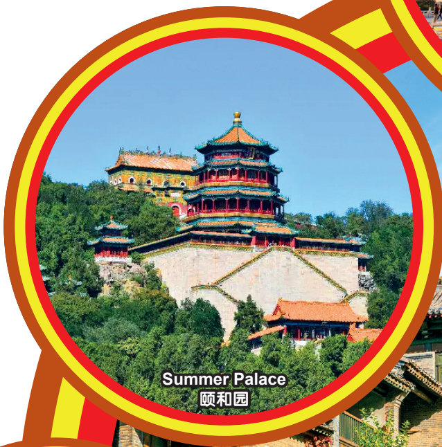
Summer Palace 颐和园