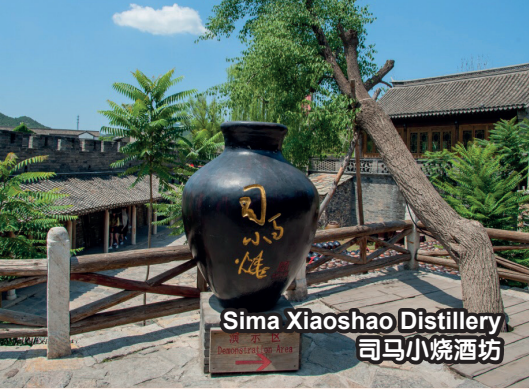
Sima Xiaoshao Distillery 司马小烧酒坊