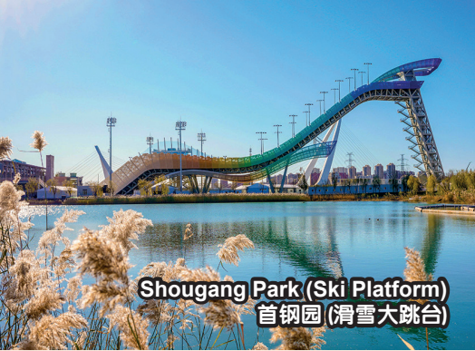
Shougang Park (Ski Platform) 首钢园 (滑雪大跳台)