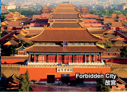
Forbidden City 故宫