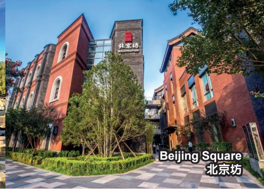
Beijing Square 北京坊