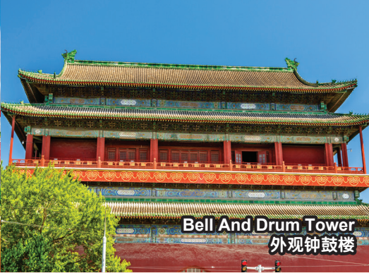
Bell And Drum Tower 外观钟鼓楼