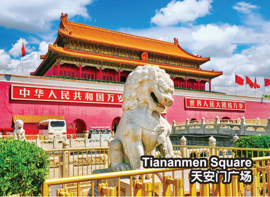
Tiananmen Square 天安门广场