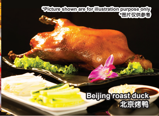
Beijing roast duck 北京烤鸭

*Picture shown are for illustration purpose only *图片仅供参考