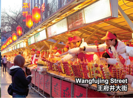
Wangfujing Street 王府井大街