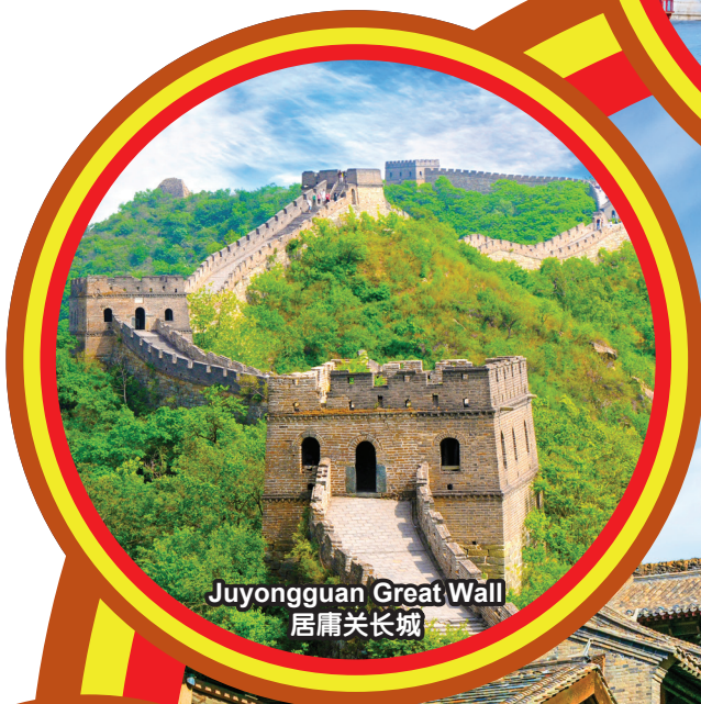
Juyongguan Great Wall 居庸关长城