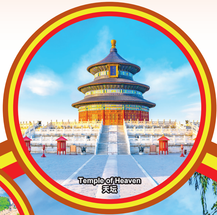
Temple of Heaven 天坛