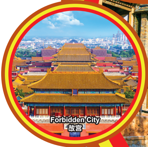
Forbidden City 故宫

行程次序，以当地旅社安排为准。 Sequences of Itinerary are subject to local arrangement.