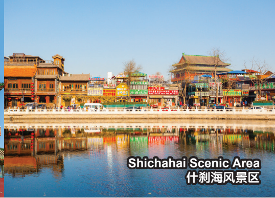
Shichahai Scenic Area 什刹海风景区