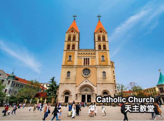
Catholic Church 天主教堂