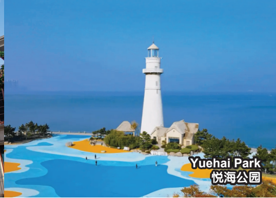
Yuehai Park 悦海公园