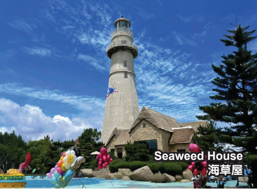
Seaweed House 海草屋