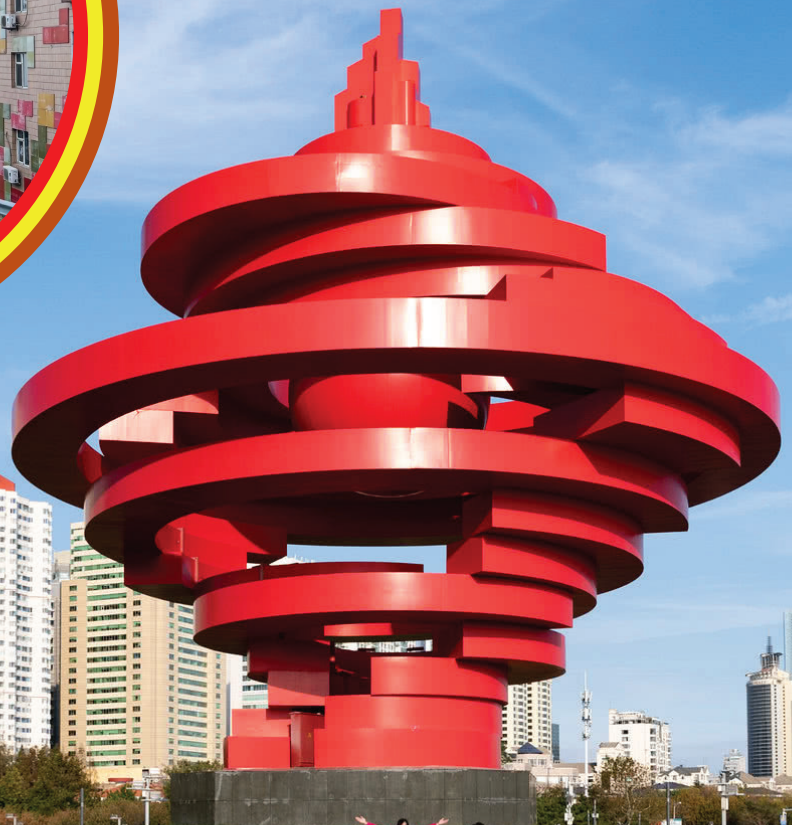
May Fourth Square 五四广场

行程次序, 以当地旅社安排为准。 Sequences of Itinerary are subject to local arrangement.