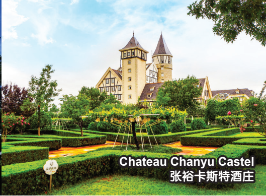
Chateau Chanyu Castel 张裕卡斯特酒庄