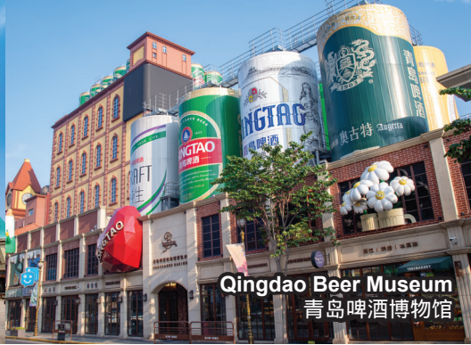
Qingdao Beer Museum 青岛啤酒博物馆