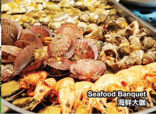
Seafood Banquet 海鲜大咖