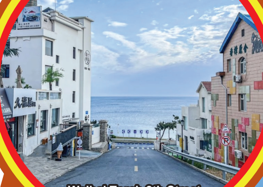
Weihai Torch 8th Street 威海火炬八街