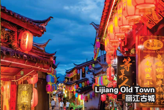
Lijiang Old Town 丽江古城