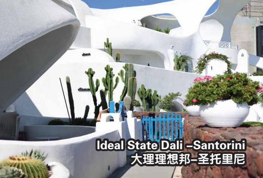
Ideal State Dali - Santorini 大理理想邦-圣托里尼