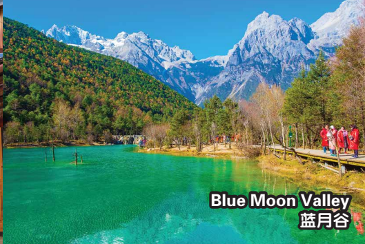
Blue Moon Valley 蓝月谷