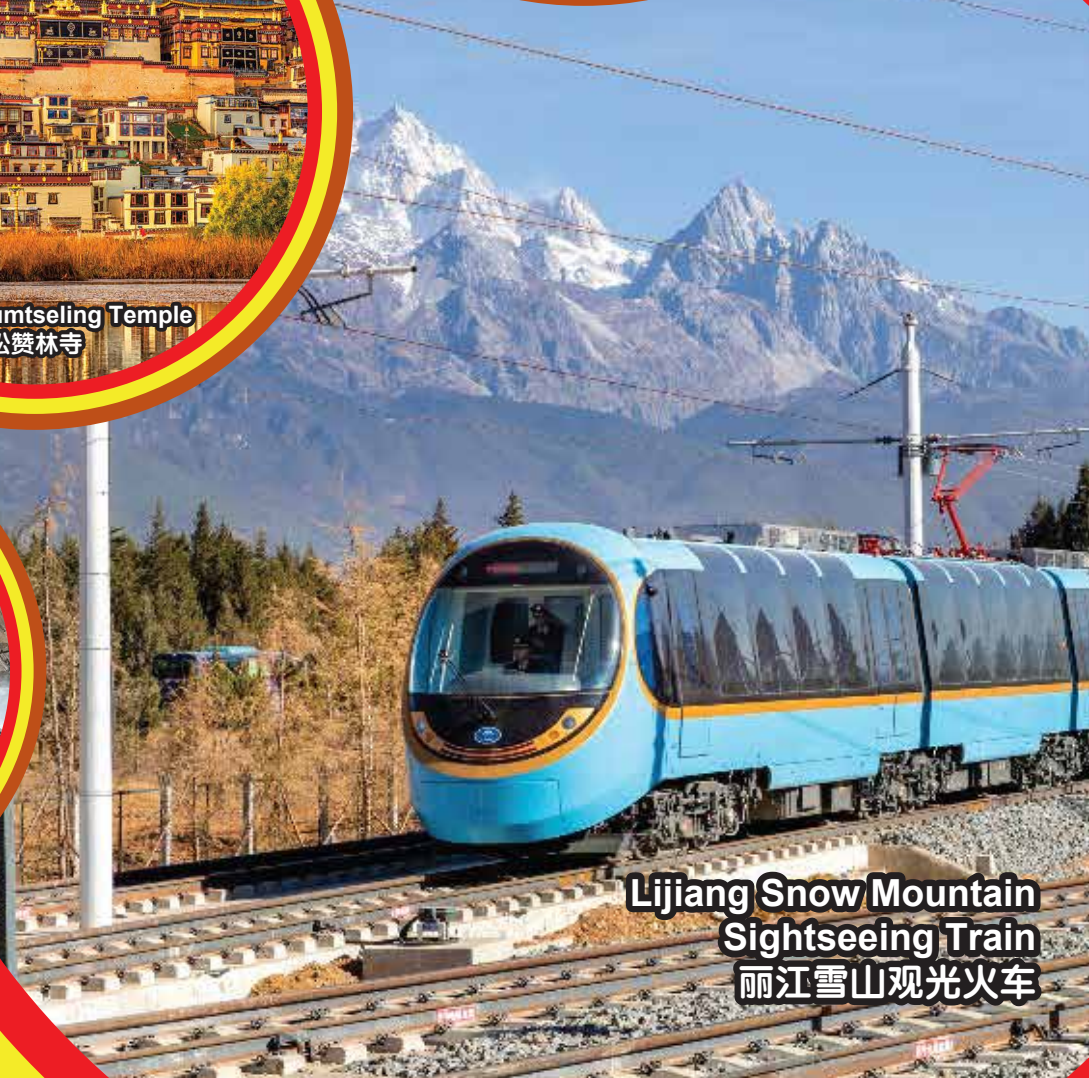
Lijiang Snow Mountain Sightseeing Train 丽江雪山观光火车

行程次序，以当地旅社安排为准。 Sequences of Itinerary are subject to local arrangement.