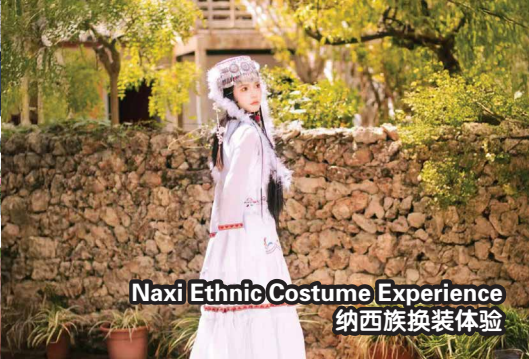
Naxi Ethnic Costume Experience 纳西族换装体验