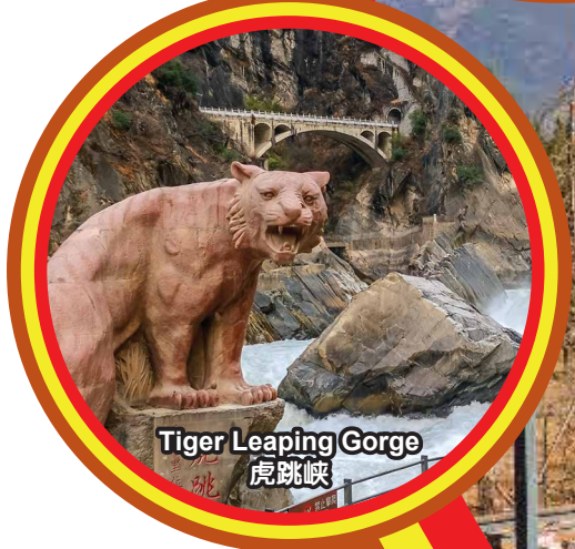
Tiger Leaping Gorge 虎跳峡