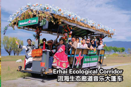
Erhai Ecological Corridor 洱海生态廊道音乐大篷车