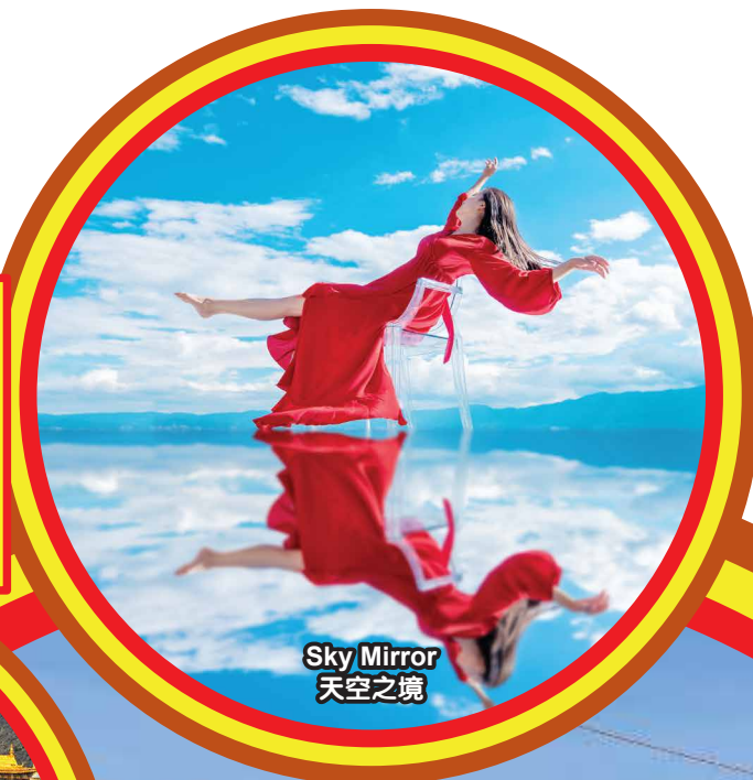
Sky Mirror 天空之境