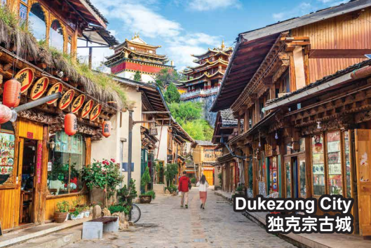
Dukezong City 独克宗古城