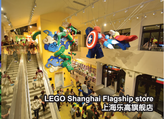
LEGO Shanghai Flagship store 上海乐高旗舰店