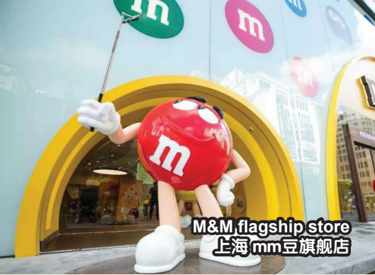
M&M flagship store 上海mm豆旗舰店