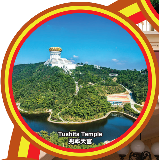
Tushita Temple 兜率天宫