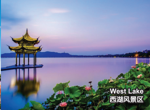
West Lake 西湖风景区