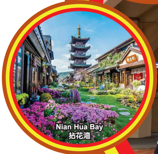
Nian Hua Bay 拈花湾