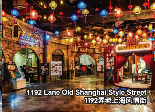
1192 Lane Old Shanghai Style Street 1192弄老上海风情街