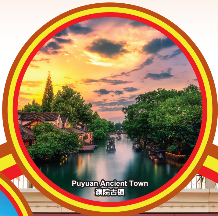
Puyuan Ancient Town 濮院古镇