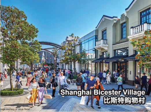
Shanghai Bicester Village 比斯特购物村