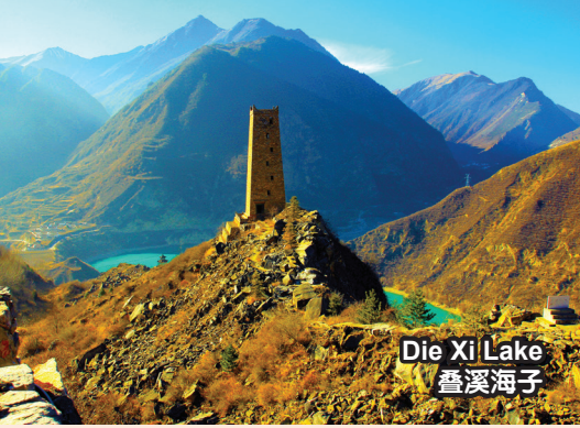
Die Xi Lake 叠溪海子