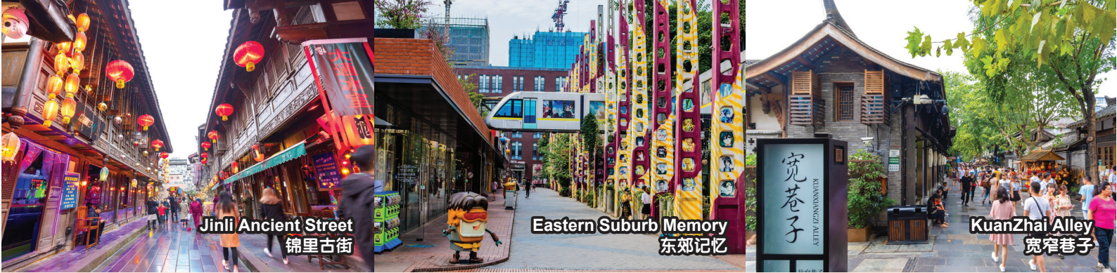
Jinli Ancient Street 锦里古街