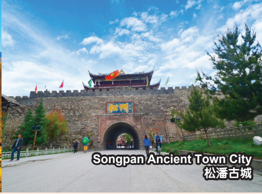
Songpan Ancient Town City 松潘古城