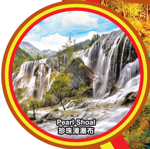
Pearl Shoal 珍珠滩瀑布

行程次序，以当地旅社安排为准。 Sequences of Itinerary are subject to local arrangement.