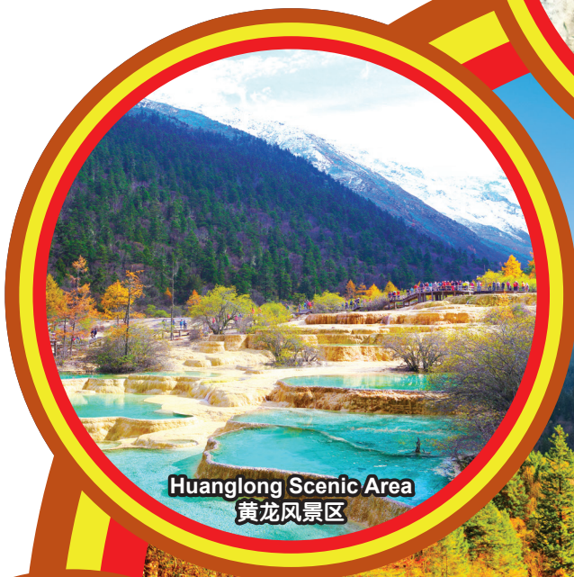
Huanglong Scenic Area 黄龙风景区