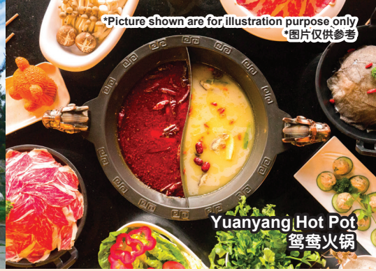
Yuanyang Hot Pot 鸳鸯火锅

*Picture shown are for illustration purpose only *图片仅供参考