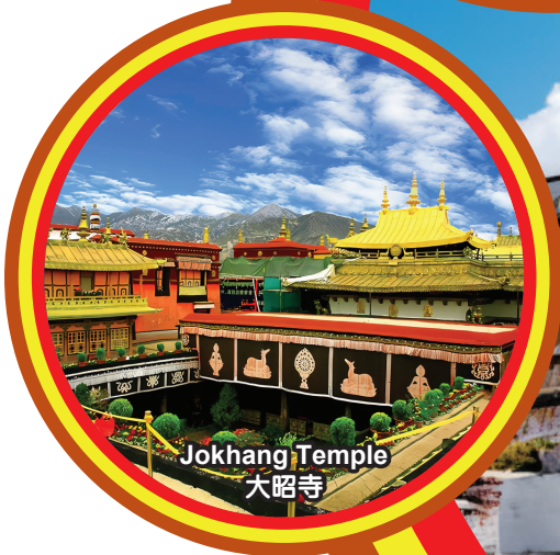
Jokhang Temple 大昭寺