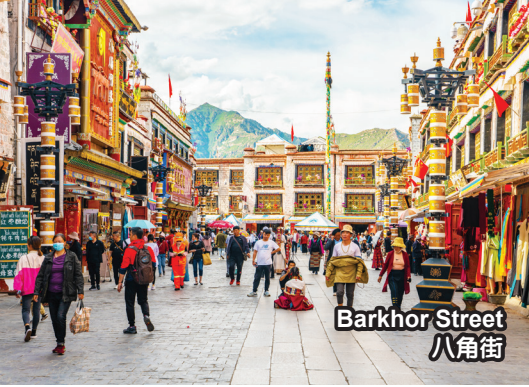
Barkhor Street 八角街