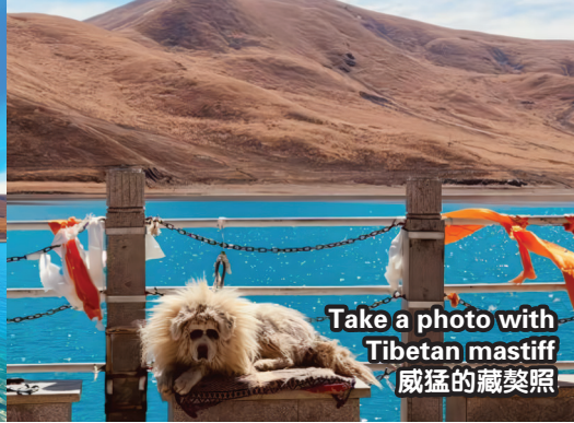
Take a photo with Tibetan mastiff 威猛的藏獒照