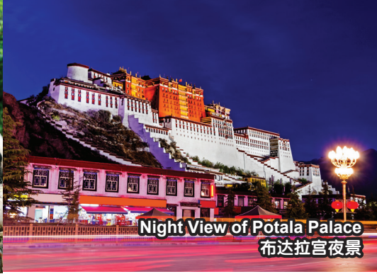
Night View of Potala Palace 布达拉宫夜景