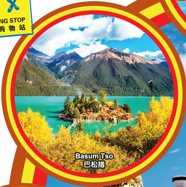
Basum Tso 巴松措