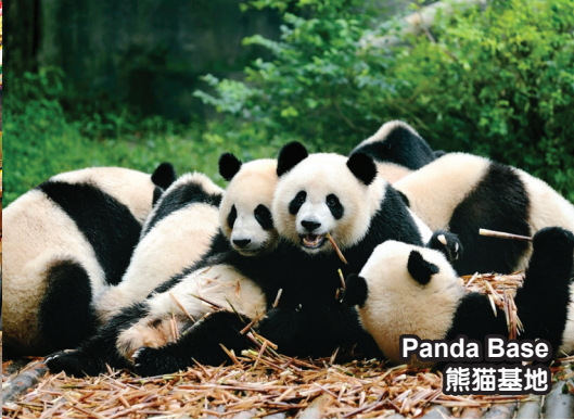
Panda Base 熊猫基地