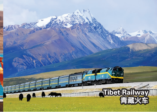
Tibet Railway 青藏火车