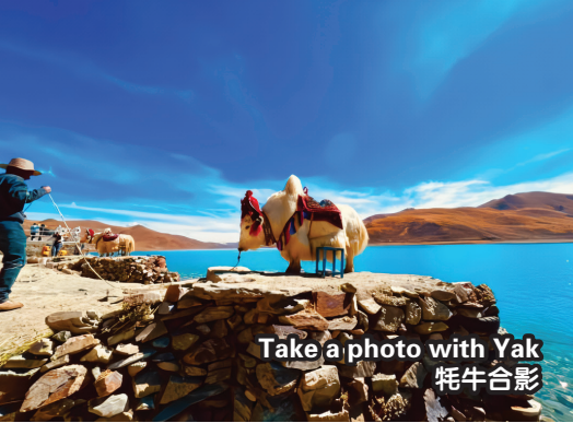
Take a photo with Yak 牦牛合影