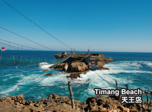
Timang Beach 天王岛