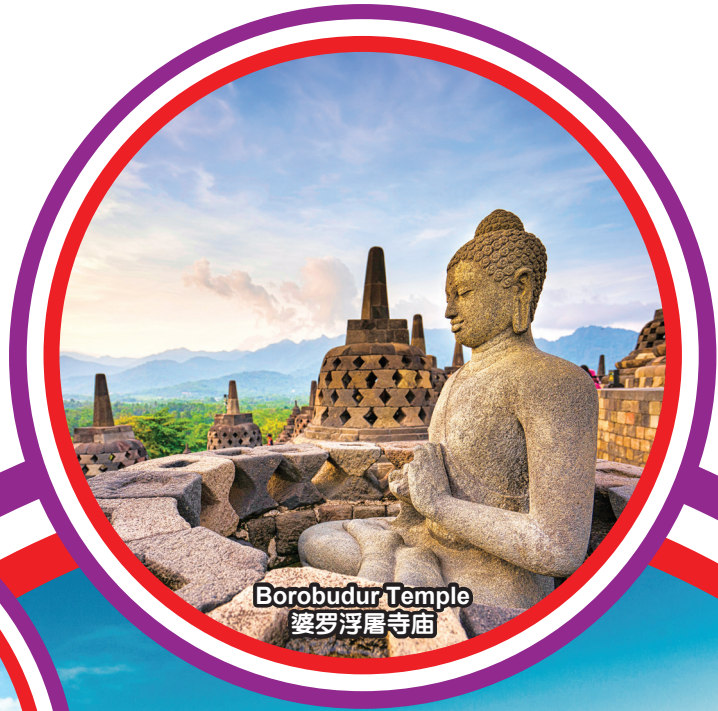
Borobudur Temple 婆罗浮屠寺庙