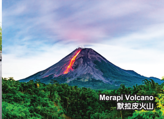
Merapi Volcano 默拉皮火山