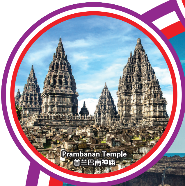
Prambanan Temple 普兰巴南神庙