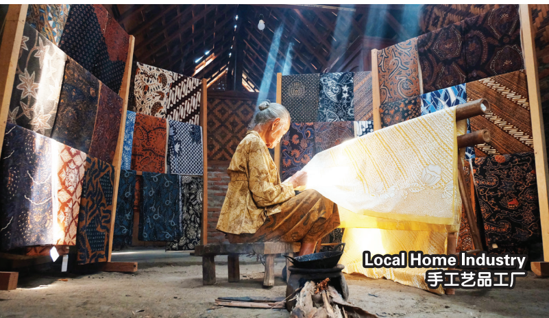
Local Home Industry 手工艺品厂