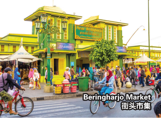
Beringharjo Market 街头市集