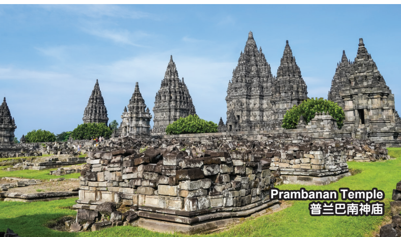
Prambanan Temple 普兰巴南神庙

✓ Crystal Lotus Hotel or similar class x3 Nights