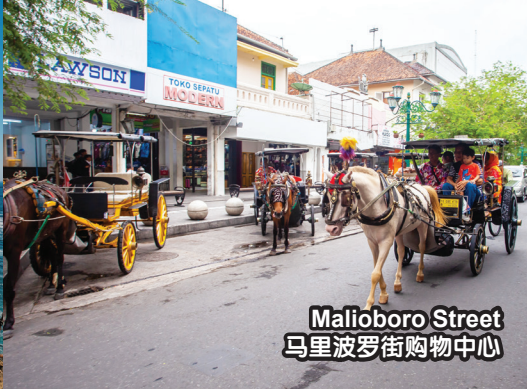
Malioboro Street 马里波罗街购物中心