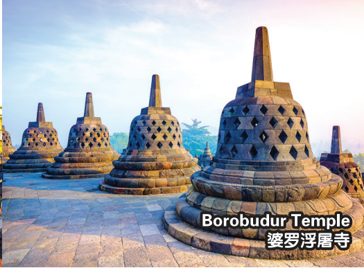
Borobudur Temple 婆罗浮屠寺