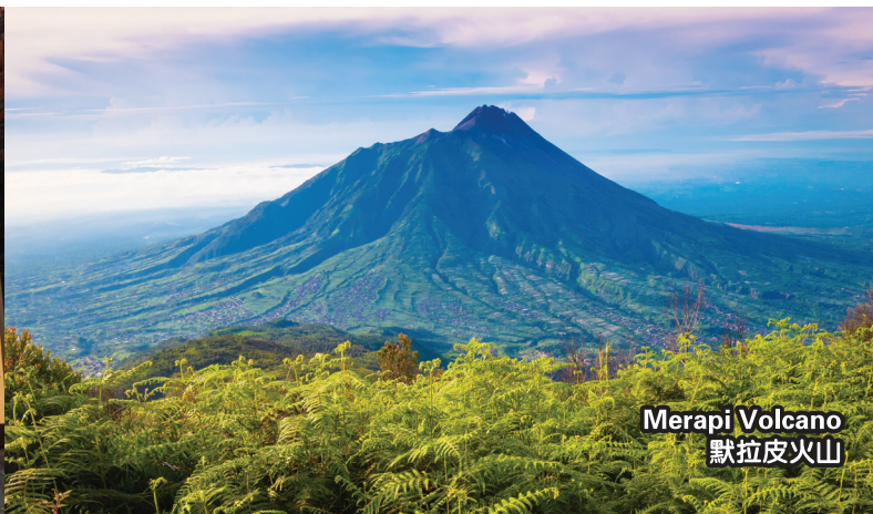
Merapi Volcano 默拉皮火山