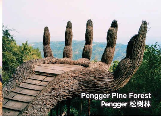
Pengger Pine Forest Pengger 松树林