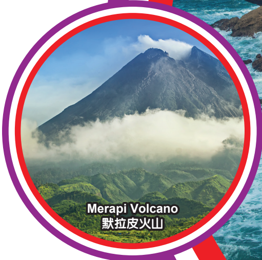
Merapi Volcano 默拉皮火山

行程次序，以当地旅社安排为准。 Sequences of Itinerary are subject to local arrangement.