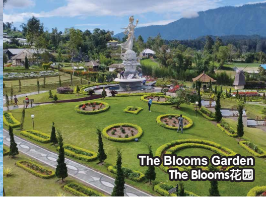
The Blooms Garden The Blooms花园