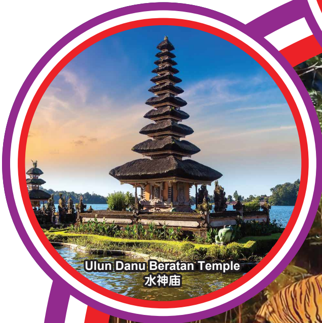
Ulun Danu Beratan Temple 水神庙