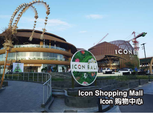
Icon Shopping Mall Icon 购物中心