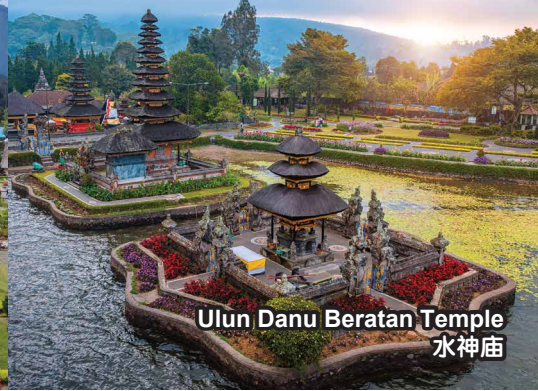
Ulun Danu Beratan Temple 水神庙