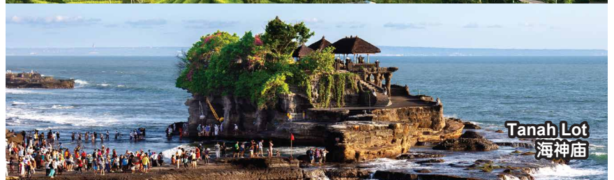
Tanah Lot 海神庙