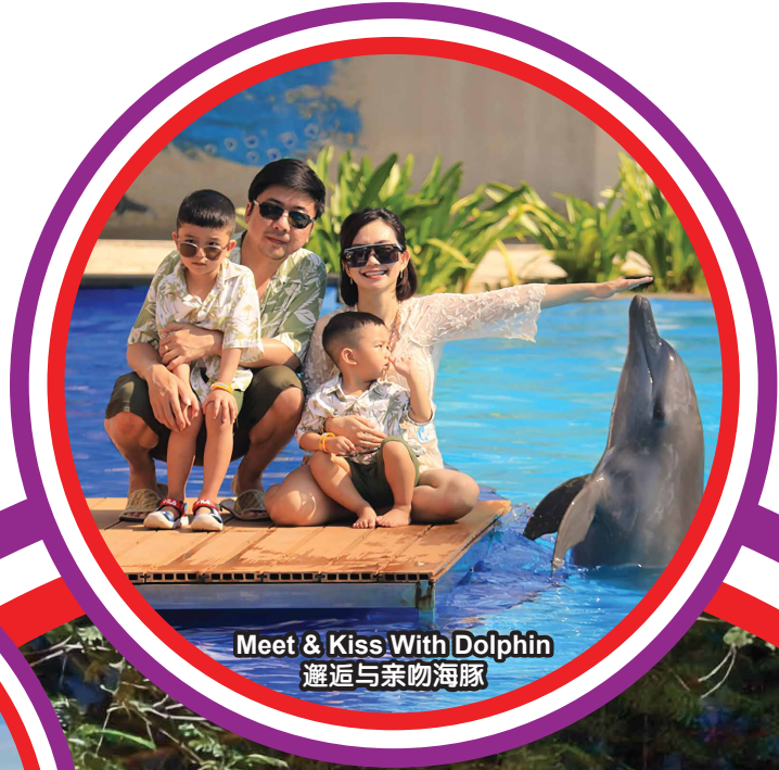
Meet & Kiss With Dolphin 邂逅与亲吻海豚