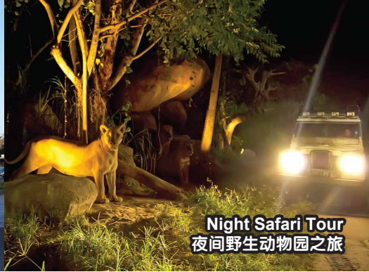
Night Safari Tour 夜间野生动物园之旅