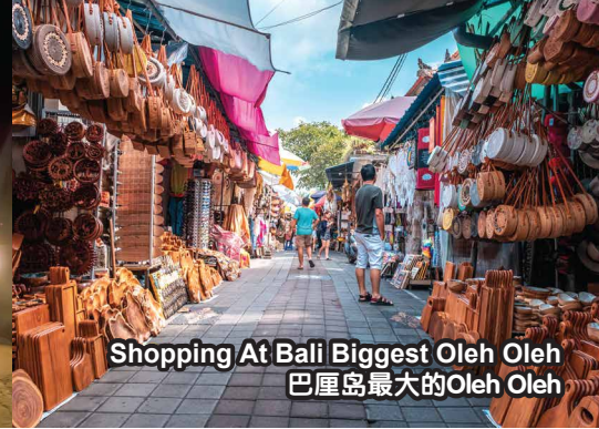
Shopping At Bali Biggest Oleh Oleh 巴厘岛最大的Oleh Oleh