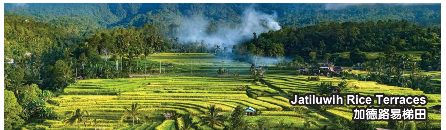
Jatiluwih Rice Terraces 加德路易梯田