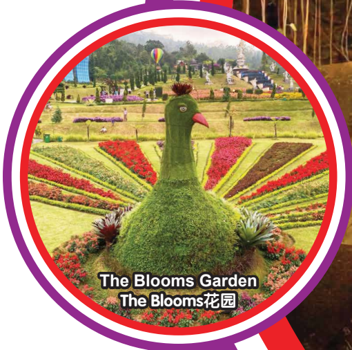
The Blooms Garden The Blooms花园

行程次序，以当地旅社安排为准。 Sequences of Itinerary are subject to local arrangement.