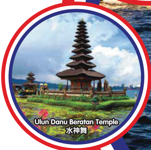
Ulun Danu Beratan Temple 水神舞

行程次序，以当地旅社安排为准。 Sequences of Itinerary are subject to local arrangement.