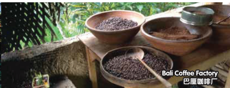
Bali Coffee Factory 巴厘咖啡厂

免责声明：由于新冠肺炎疫情旅行限制当地/宗教节日，公众假期，天气状况，交通等情况，自然灾害，必要时黄金旅程保留对行程进行适当调整（调整景点游览顺序）以确保行程顺利进行，会或否事先通知。