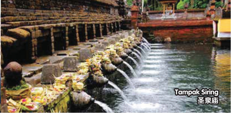
Tampak Siring 圣泉庙