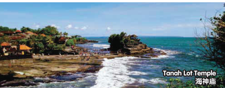
Tanah Lot Temple 海神庙