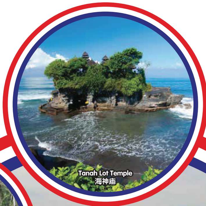
Tanah Lot Temple 海神庙