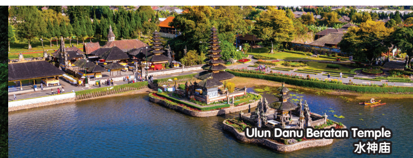
Ulun Danu Beratan Temple 水神庙

Disclaimer: Due to Covid-19 travel restrictions, local / religious festivals, public holidays, weather condition, transport technical issue, acts of nature, Golden Destinations reserved the right to alter the sequence or change, amend or alter the itinerary if necessary, with or without prior notice.