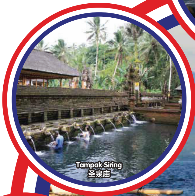
Tampak Siring 圣泉庙