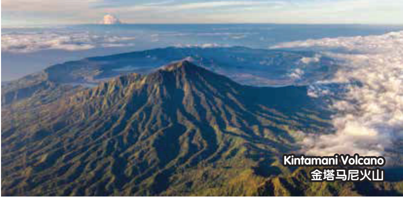
Kintamani Volcano 金塔马尼火山