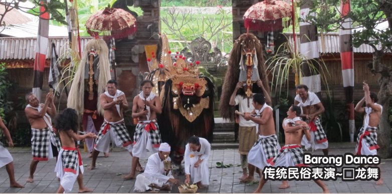
Barong Dance 传统民俗表演~龙舞