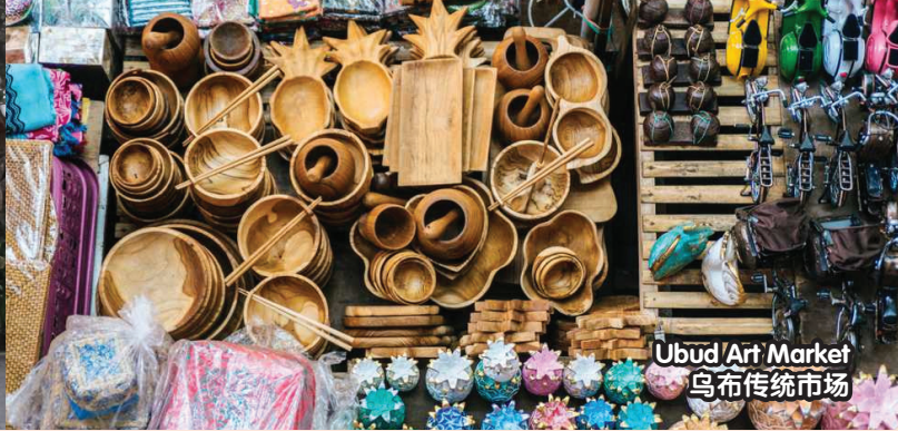
Ubud Art Market 乌布传统市场