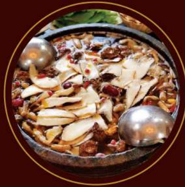
Lulang Specialty Hot Pot Chicken 鲁朗特色石锅鸡