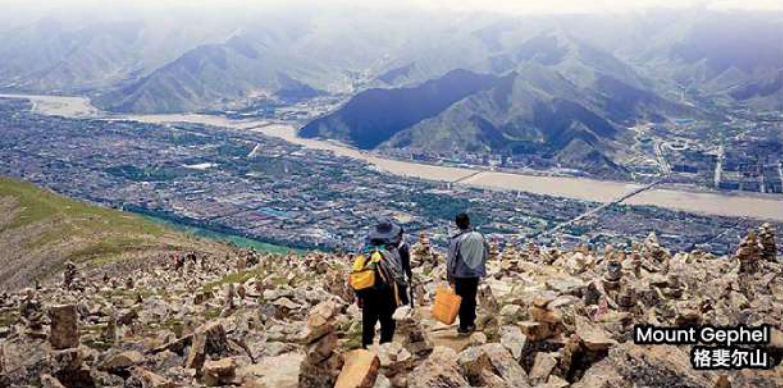
Mount Gephel 格斐尔山