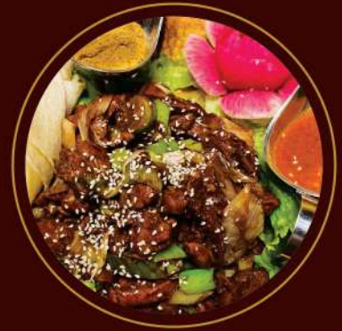
Shengxue Tibetan Cuisine. A restaurant rich in Tibetan culture and visited by many celebrities 吉祥圣雪藏餐 藏文化浓厚，很多名人光顾的餐厅