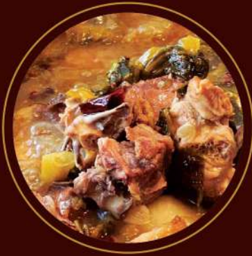
Lao Tan chicken with Pickled Green, Celtuce and Taro. Old Tibet's favorite, ten years old store, fantastic taste! 老坛酸菜竹笋芋儿鸡 老西藏的最爱，十年老店，味道奇绝