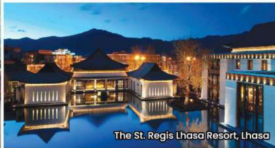
The St. Regis Lhasa Resort, Lhasa