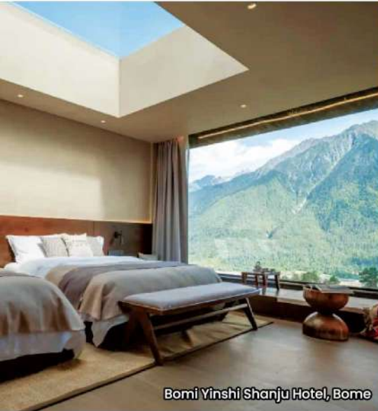
Bomi Yinshi Shanju Hotel, Bome

Embark on a complete journey at 5-star hotel, offering a quality & comfortable stay. 全程安排五星级酒店，让您在整个旅程中享受到有质量且舒适的住宿环境。