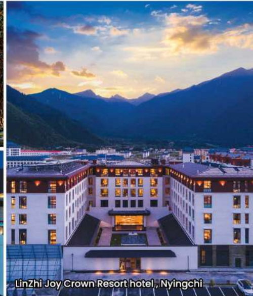
LinZhi Joy Crown Resort hotel, Nyingchi