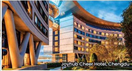
Joyhub Cheer Hotel, Chengdu